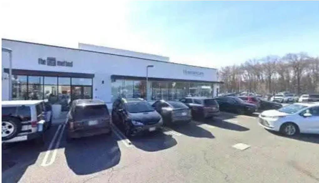
The bar method closter street view 360deg