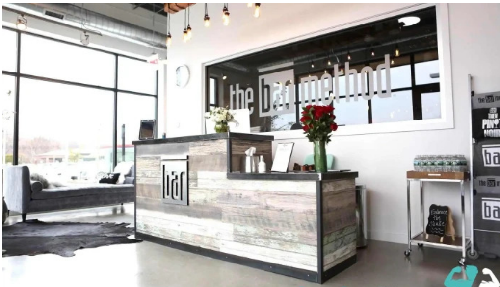
The bar method closter all