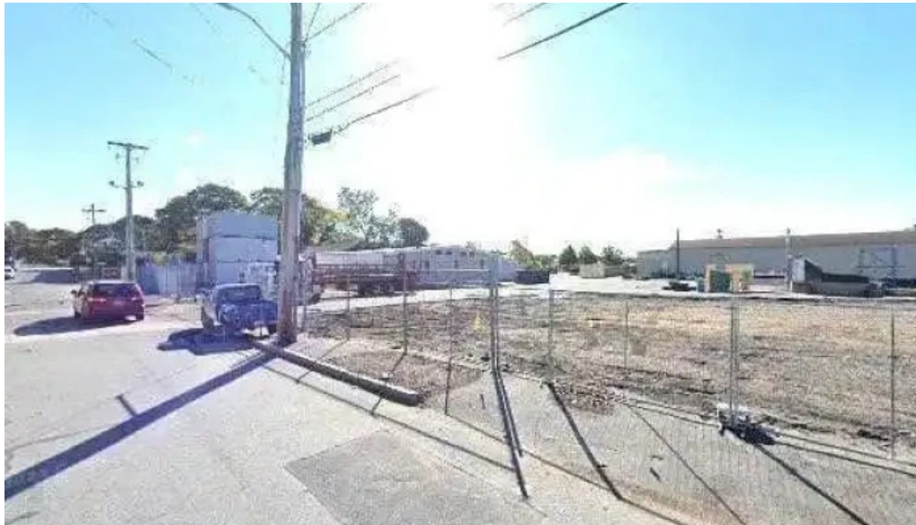
B balanced fitness street view 360deg