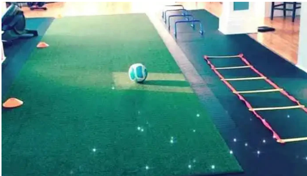
B balanced fitness fairhaven