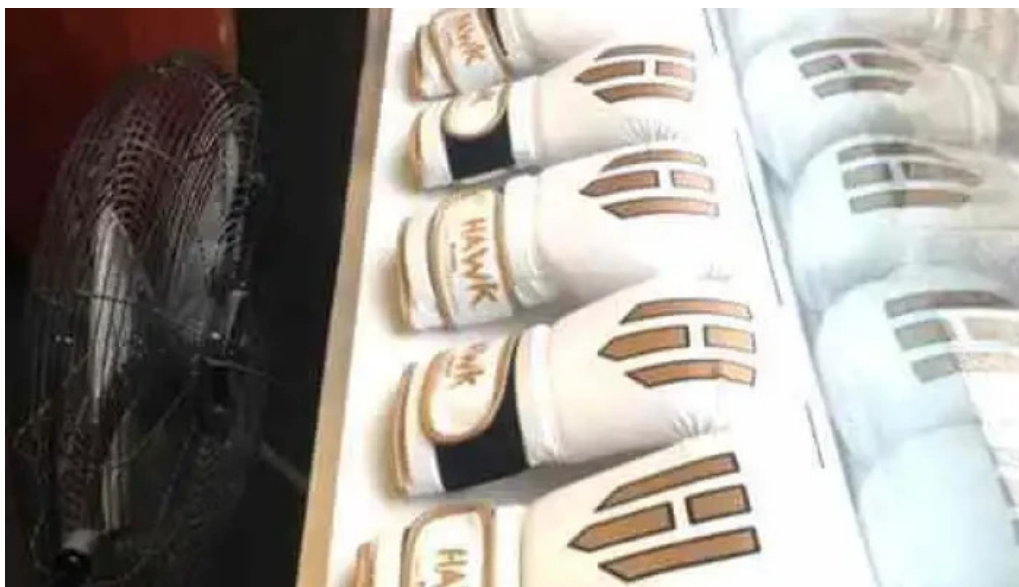
B balanced fitness by owner