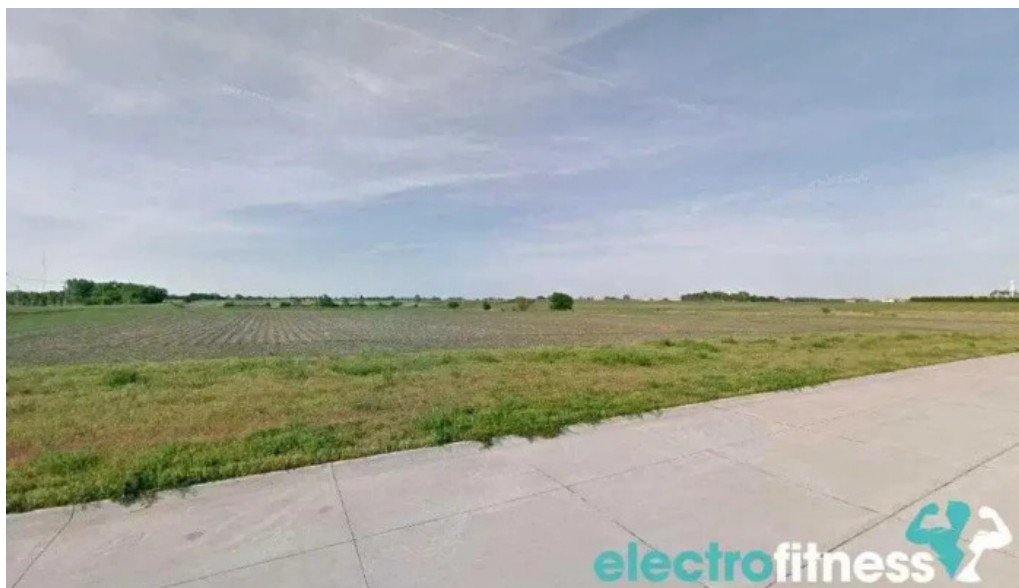
Crossfit ground up hastings