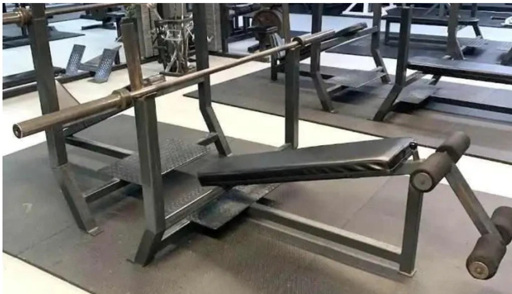
Dixie fitness highland heights