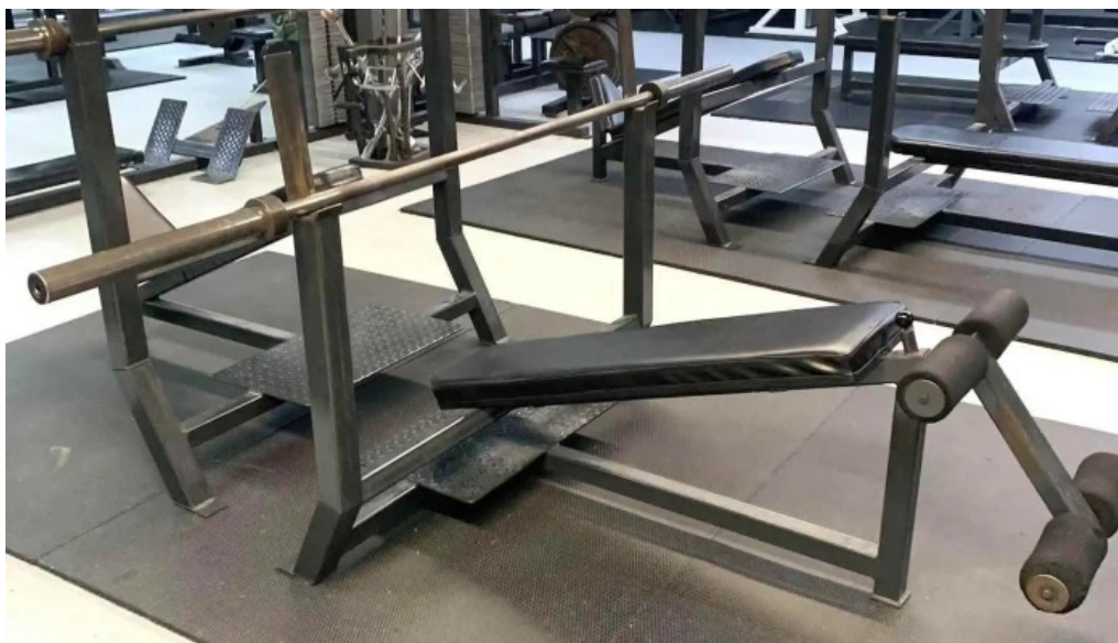
Dixie fitness all