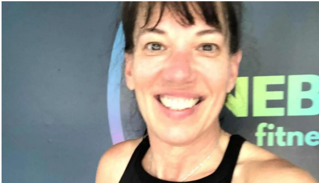
One body fitness physical fitness program