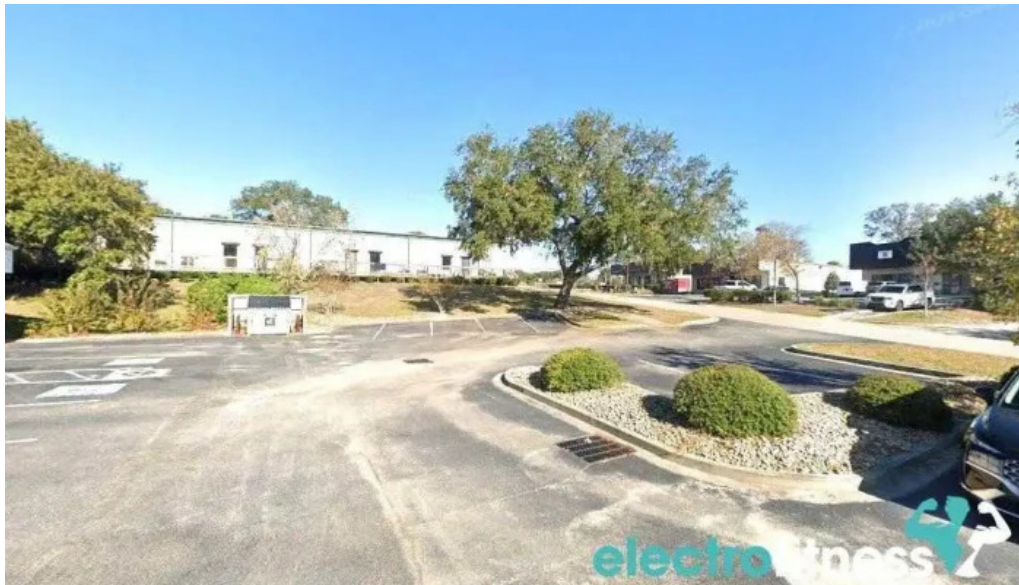
One body fitness little river