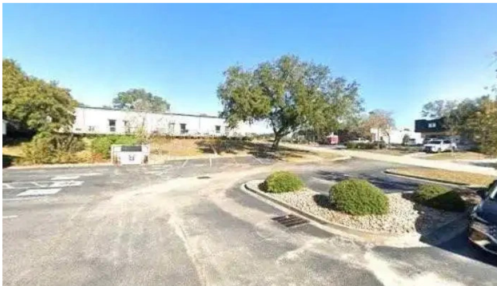
One body fitness all