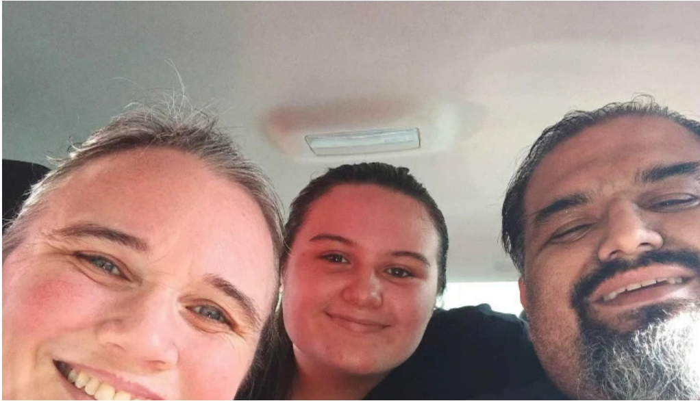
Fit body boot camp physical fitness program