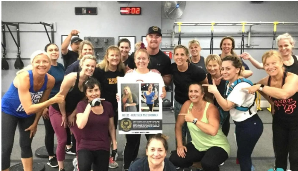
Fit body boot camp all