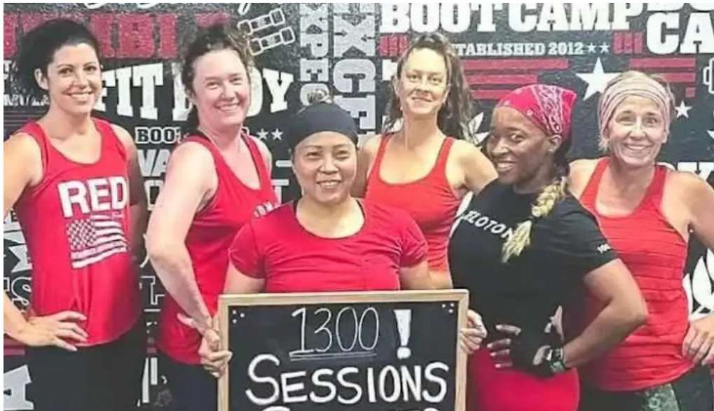
Fit body boot camp by owner