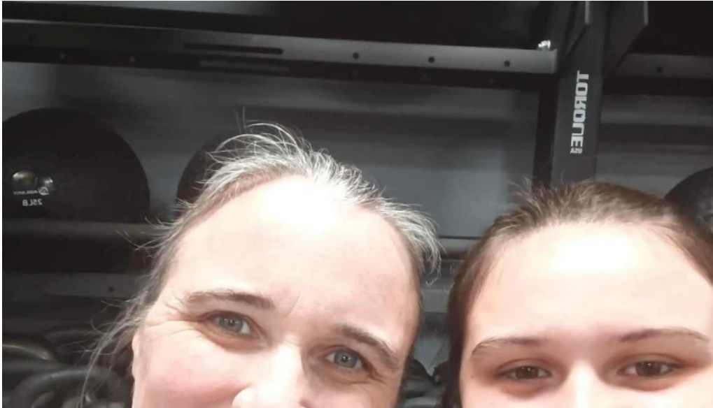
Fit body boot camp mission viejo