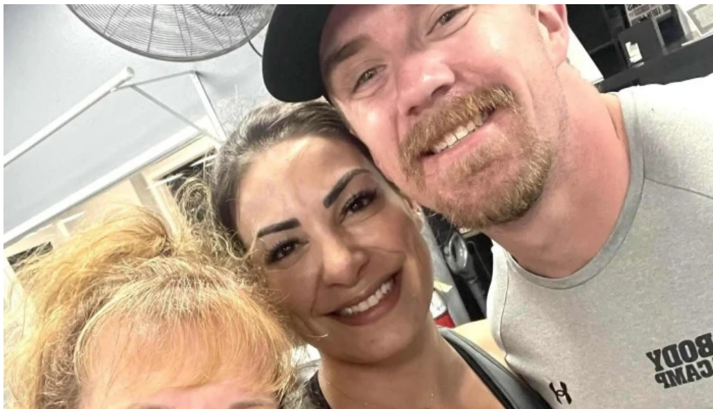
Fit body boot camp near me