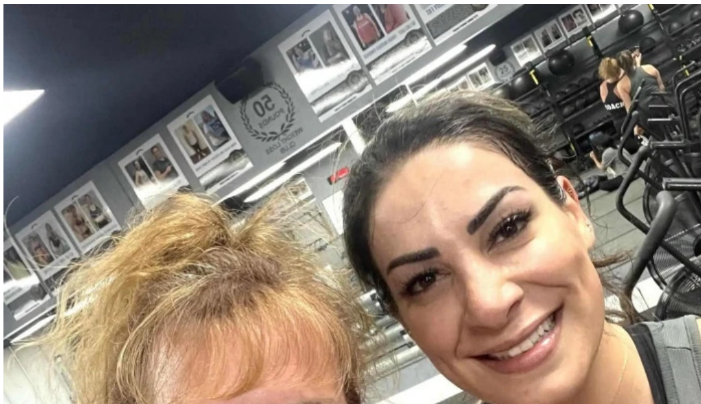
Fit body boot camp website