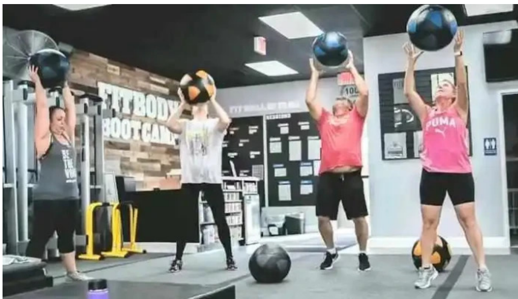
Fit body boot camp videos