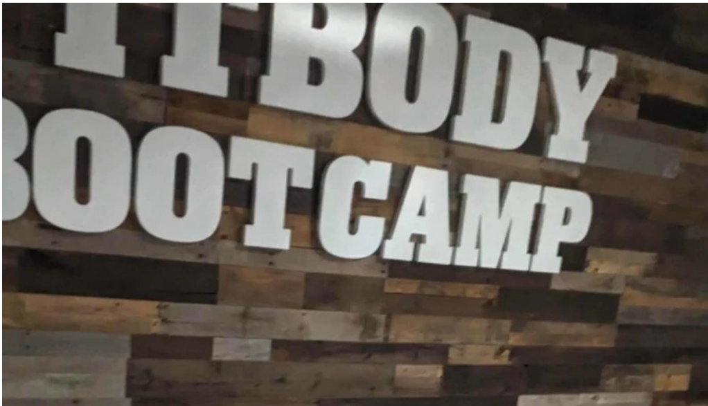
Fit body boot camp phone