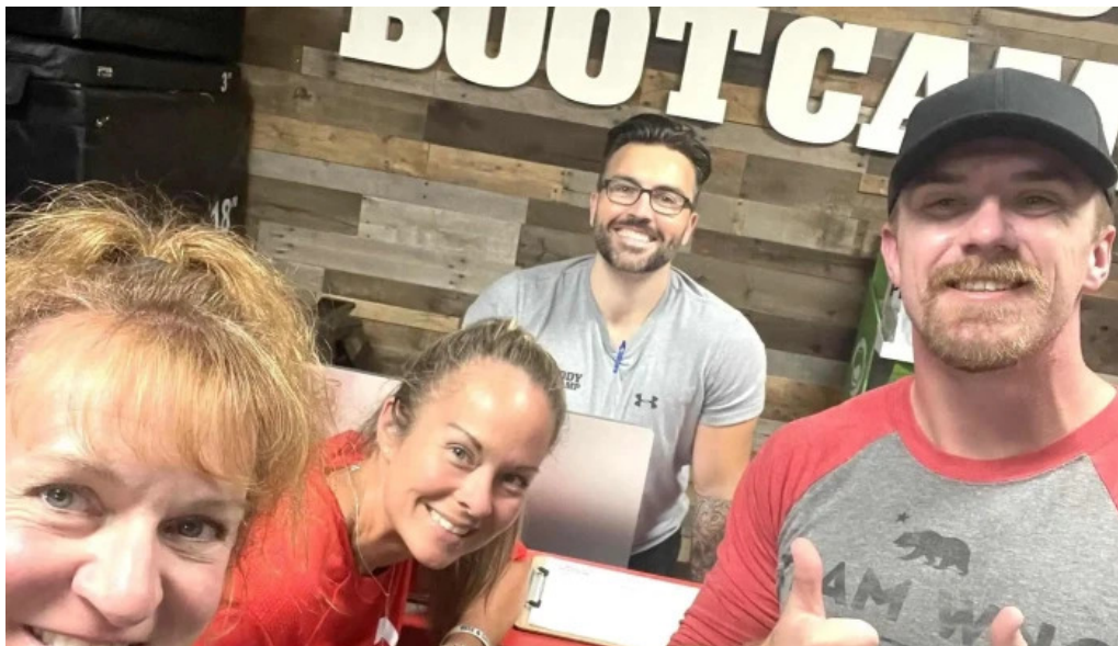
Fit body boot camp prices