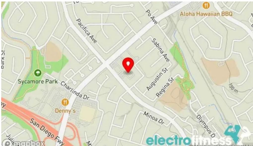
Fit body boot camp map