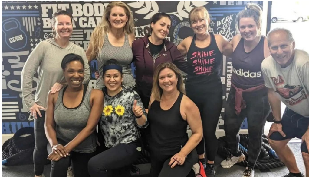
Fit body boot camp open now