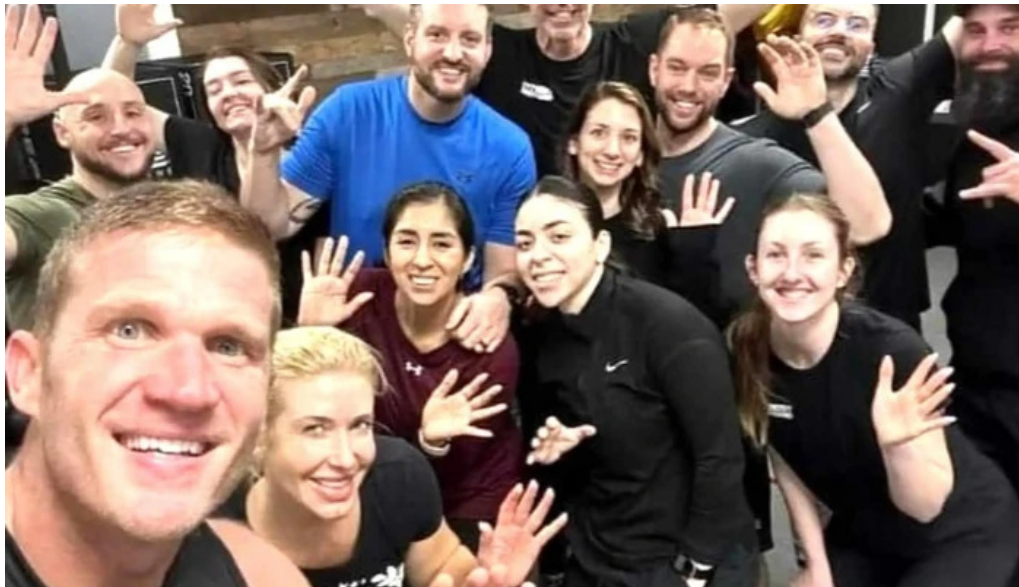
Fit body boot camp area