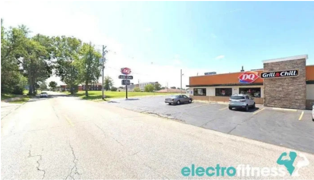
Shadow crossfit quincy

web, we urge you to send us a message so that we will handle it as soon as possible. Thank you in advance we appreciate it.