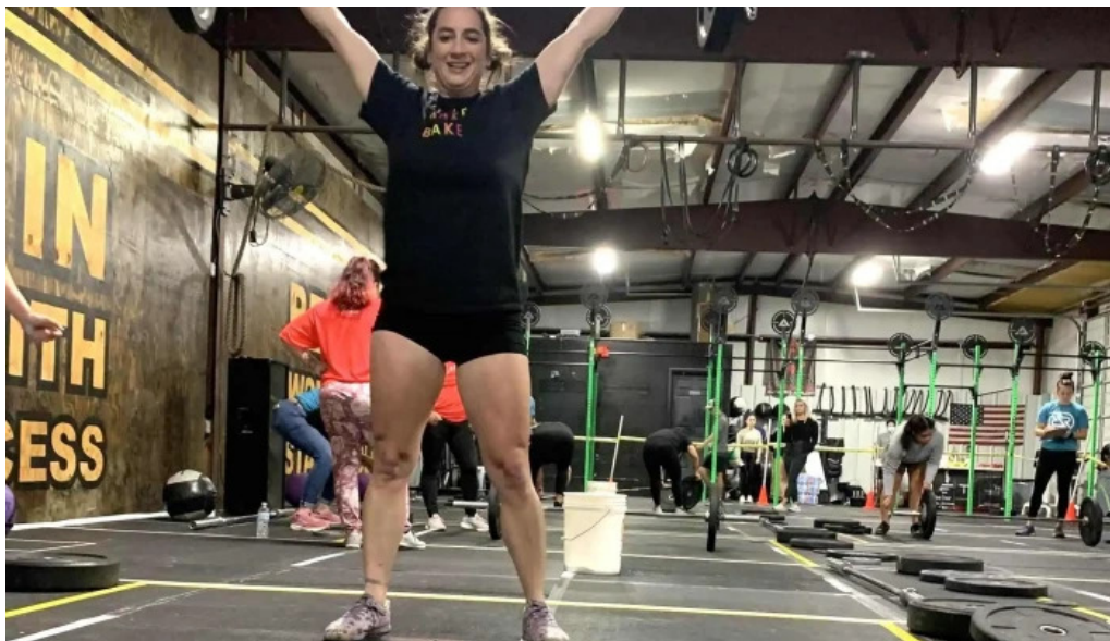
Okie flow fitness tahlequah catalog