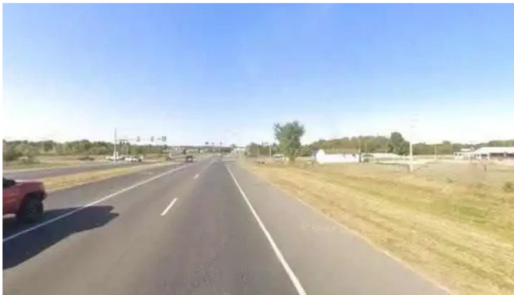
Okie flow fitness tahlequah street view 360deg