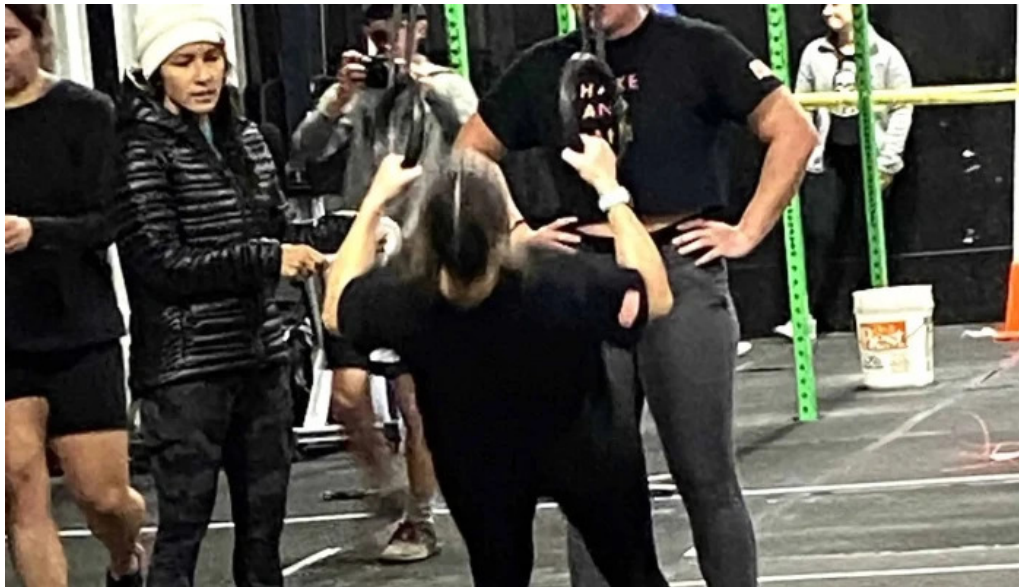
Okie flow fitness tahlequah instagram