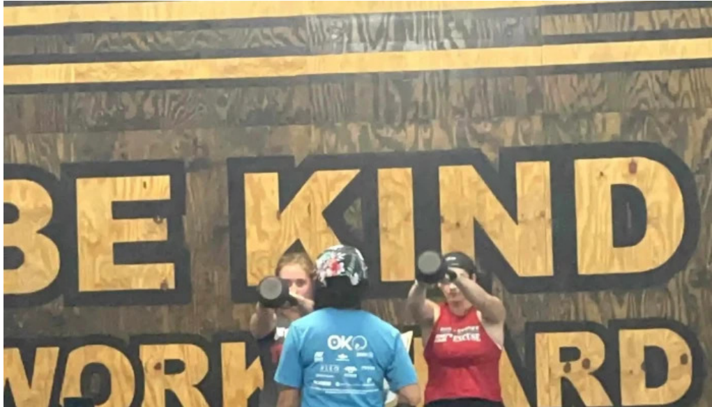
Okie flow fitness tahlequah tahlequah