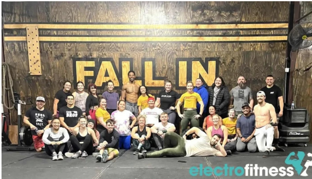
Okie flow fitness tahlequah all