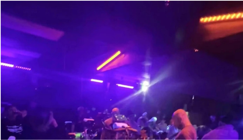
Rhythm ride physical fitness program