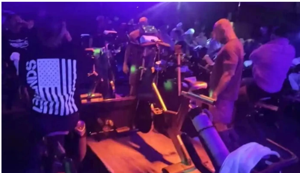
Rhythm ride videos