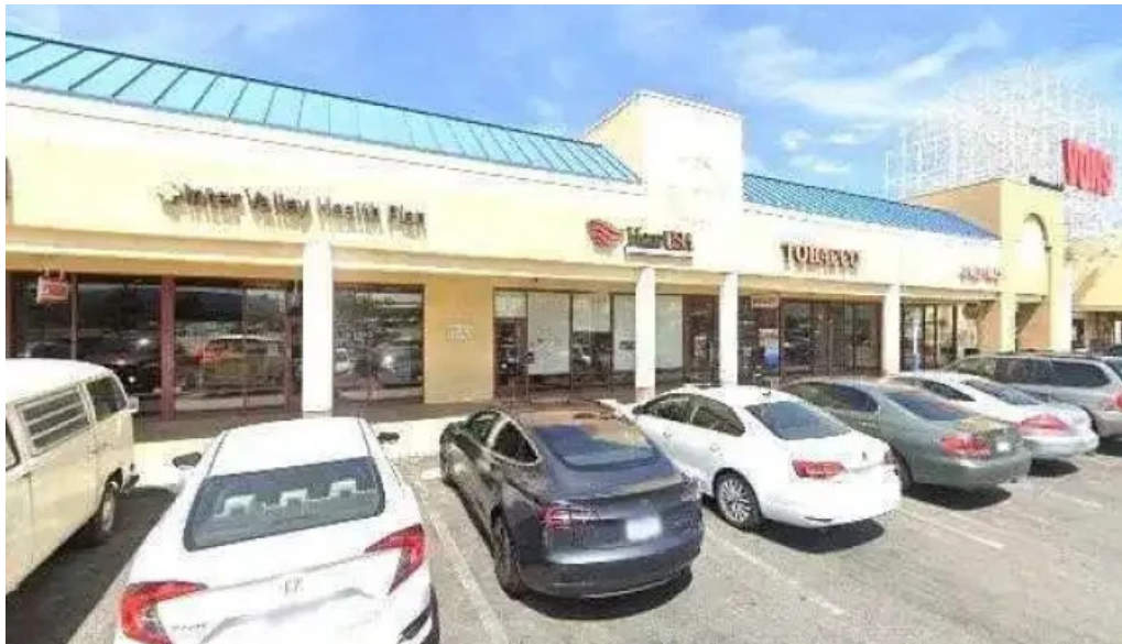
Rhythm ride all