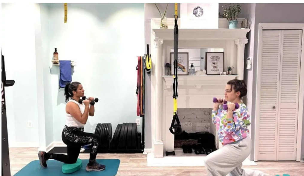
Mindful movement dc all