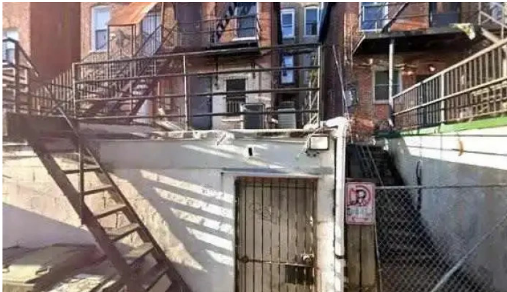
Mindful movement dc street view 360deg