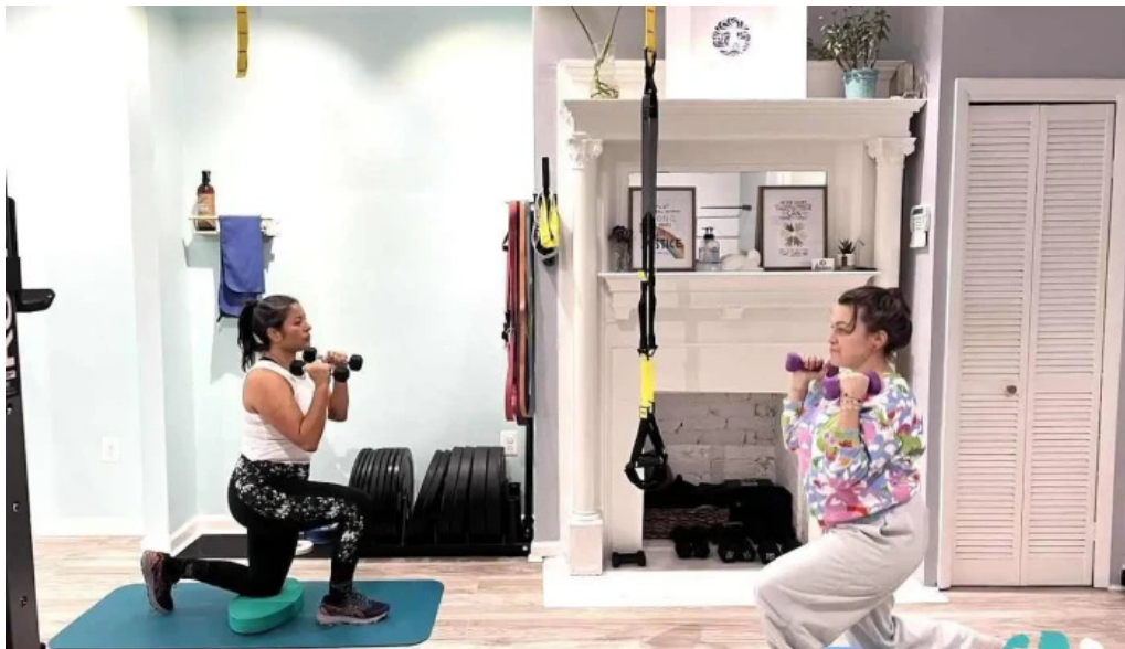
Mindful movement dc washington