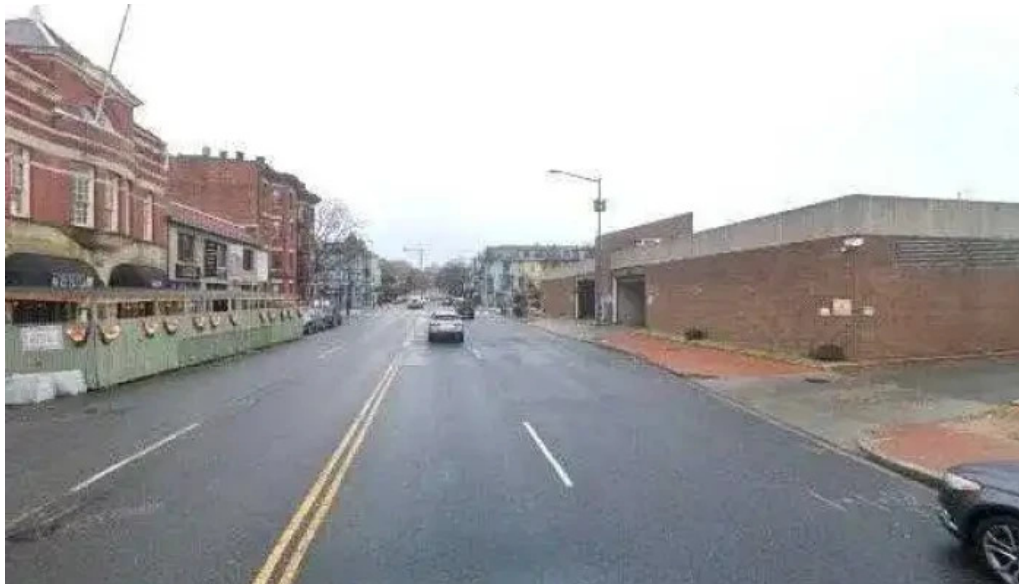
Sweatbox u street street view 360deg