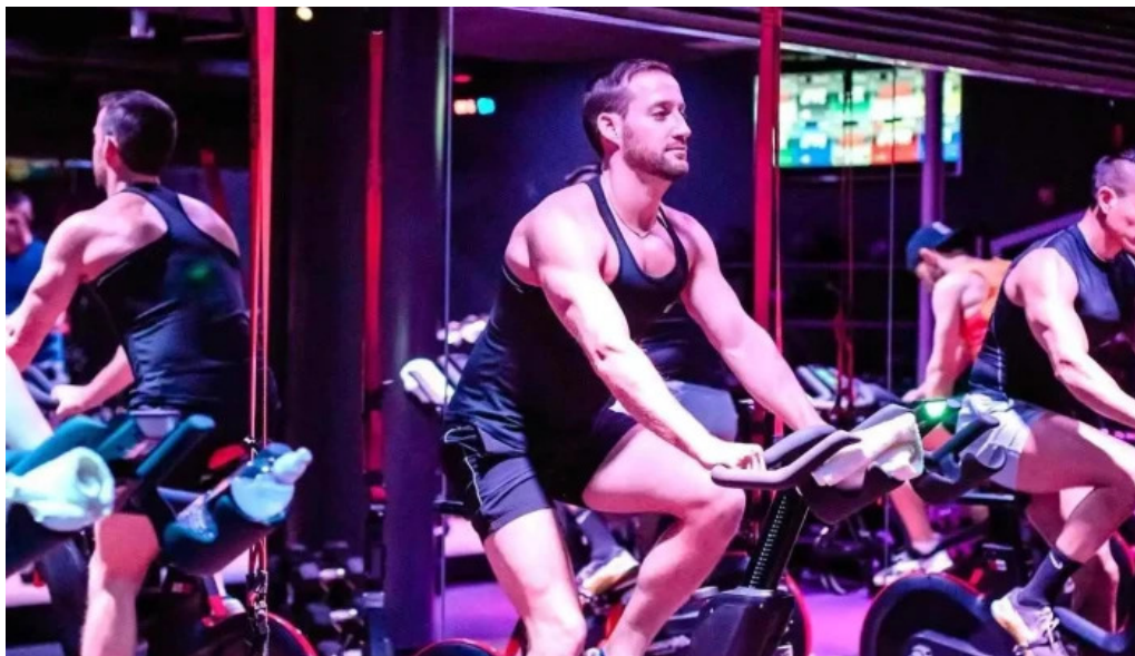
Sweatbox u street by owner