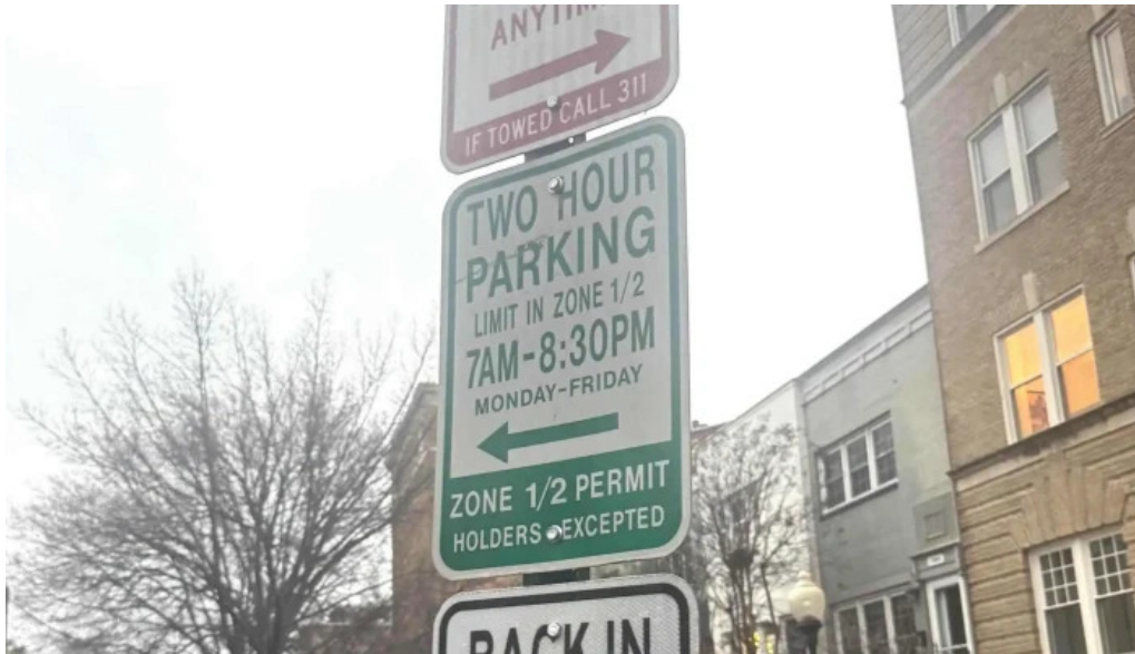
Sweatbox u street discounts