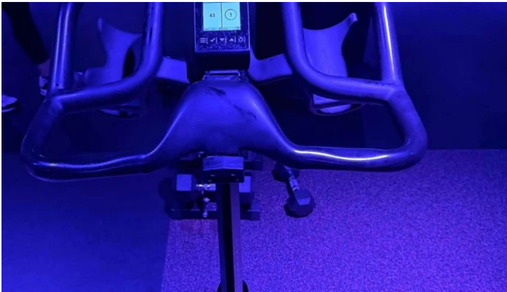
Sweatbox u street phone