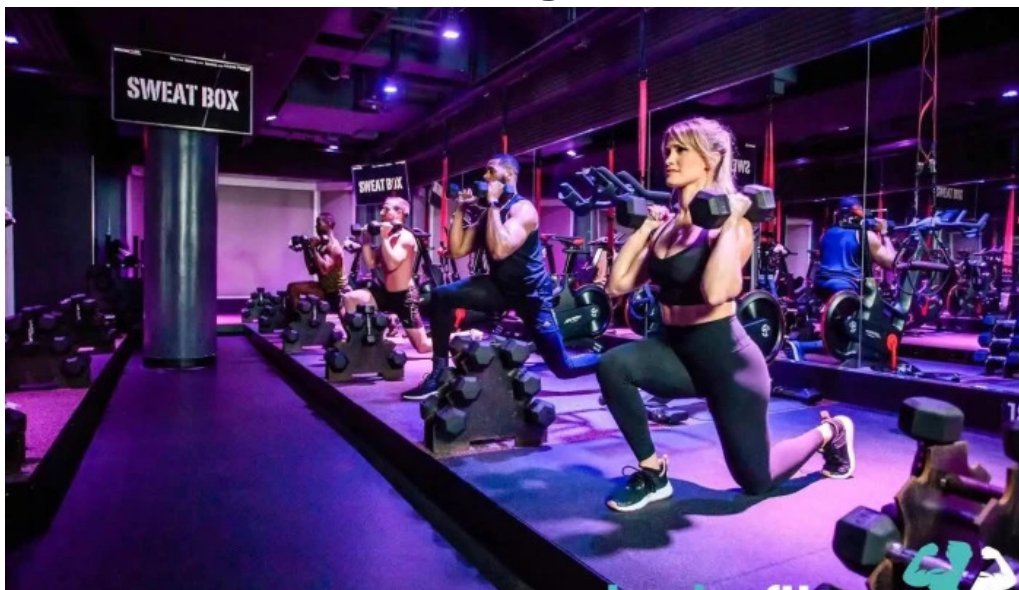
Sweatbox u street washington