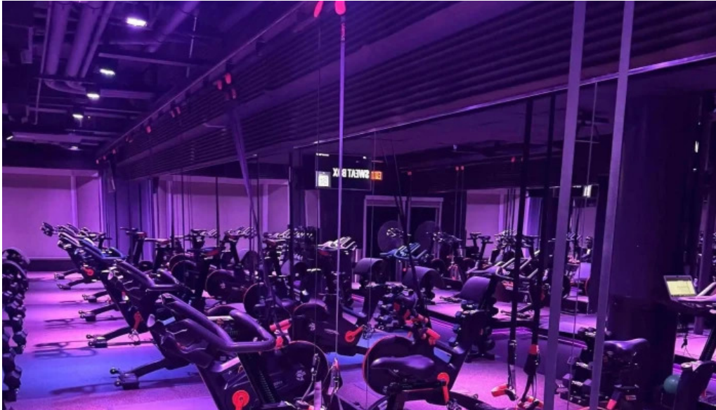
Sweatbox u street physical fitness program