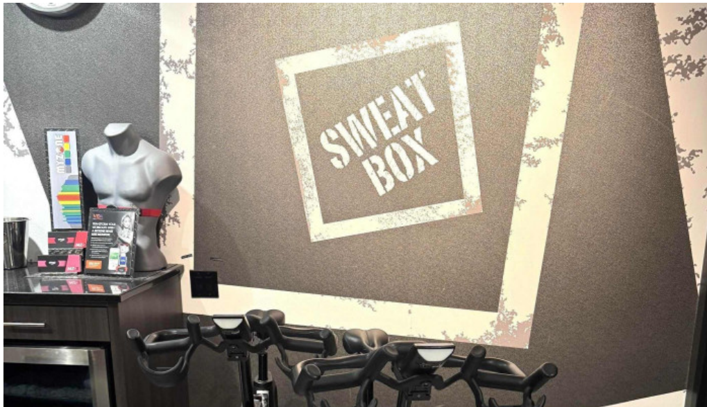
Sweatbox u street washington