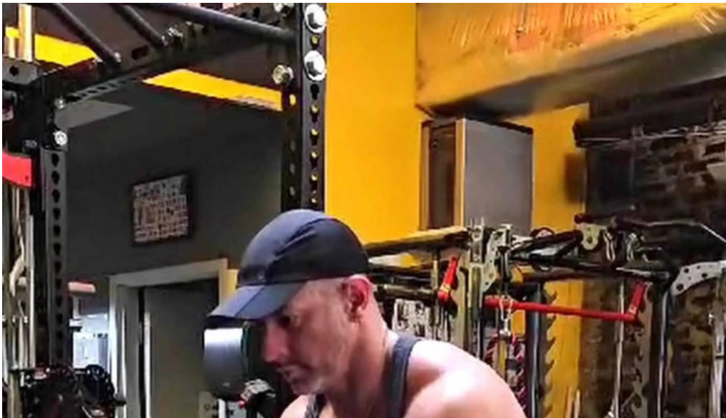
Yokofitness physical fitness program