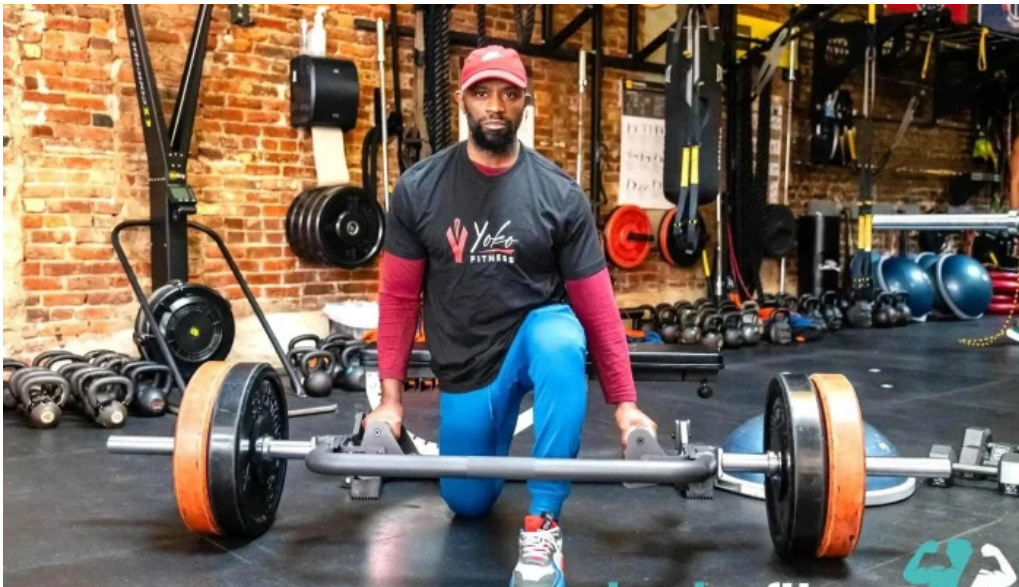
Yokofitness by owner