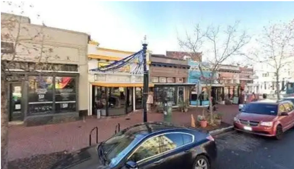
Yokofitness street view 360deg