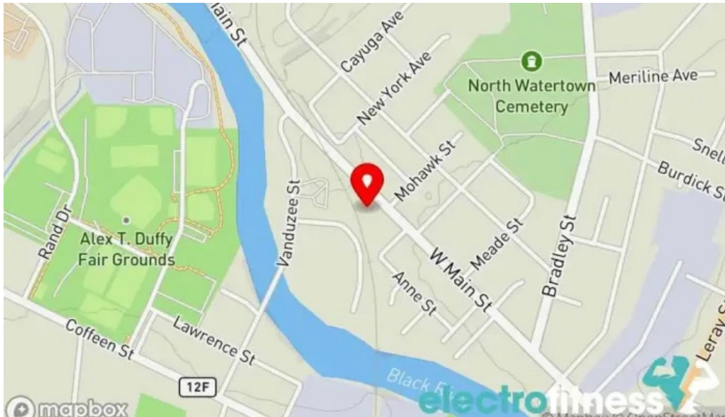
Im fitness map