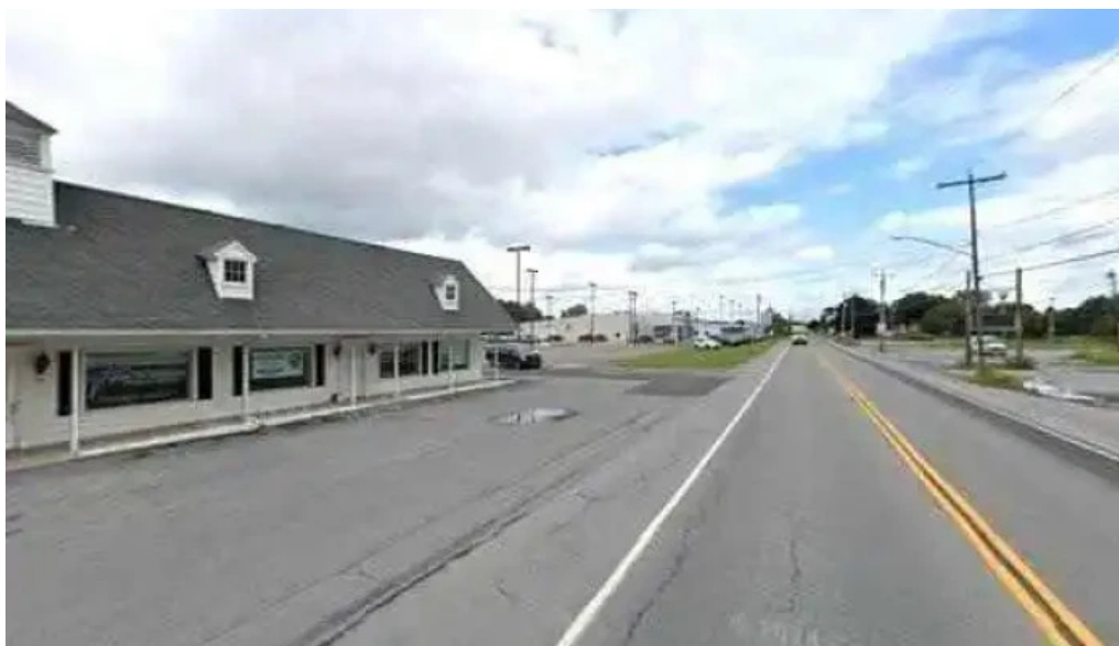
Heather a miller pt dpt all