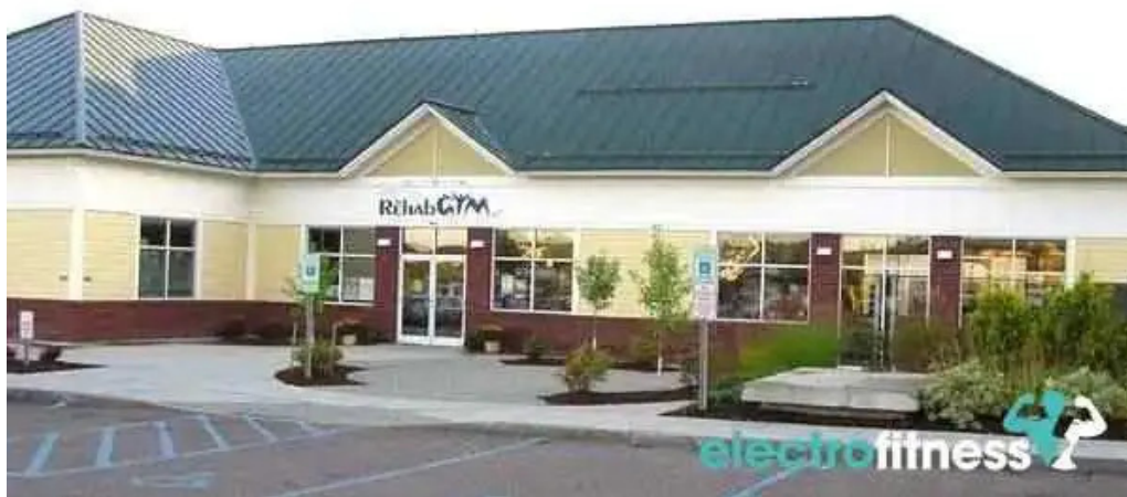
The rehabgym by owner