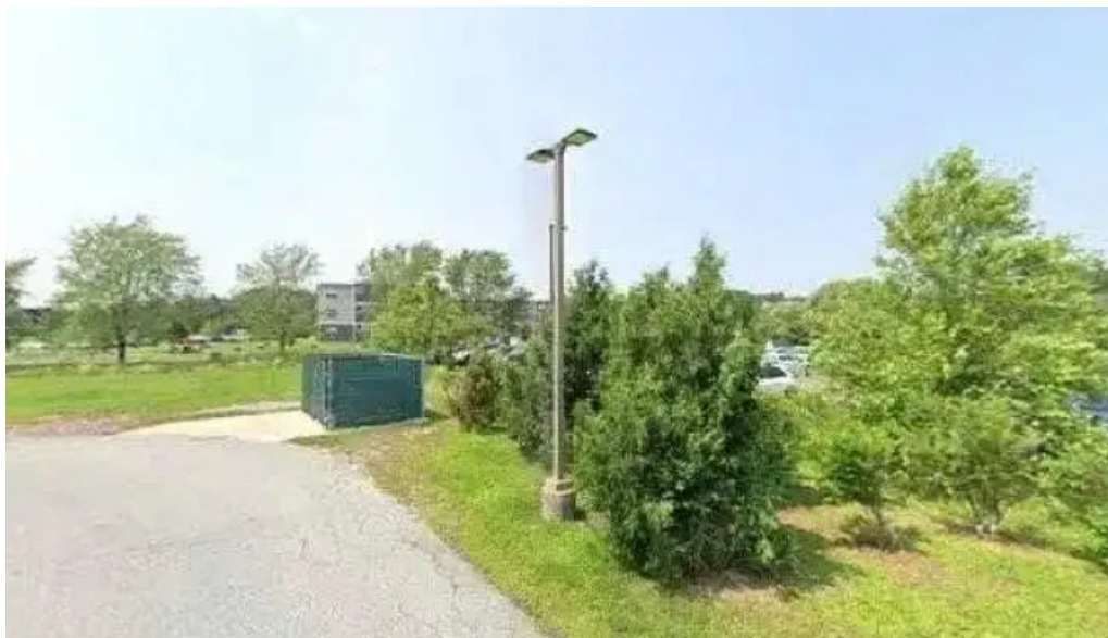
The rehabgym street view 360deg