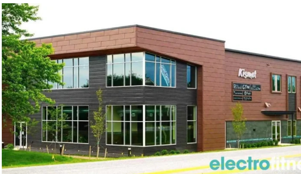
The rehabgym all