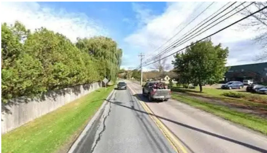
Wellfound physical therapy and fitness street view 360deg