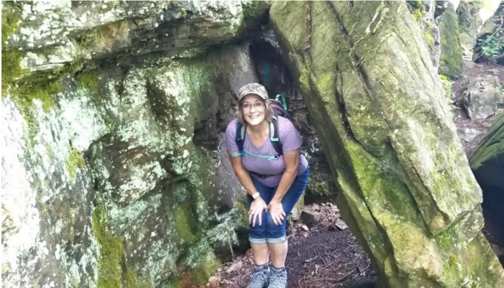
Wellfound physical therapy and fitness physical therapist