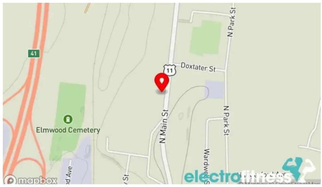
South jefferson physical therapy map