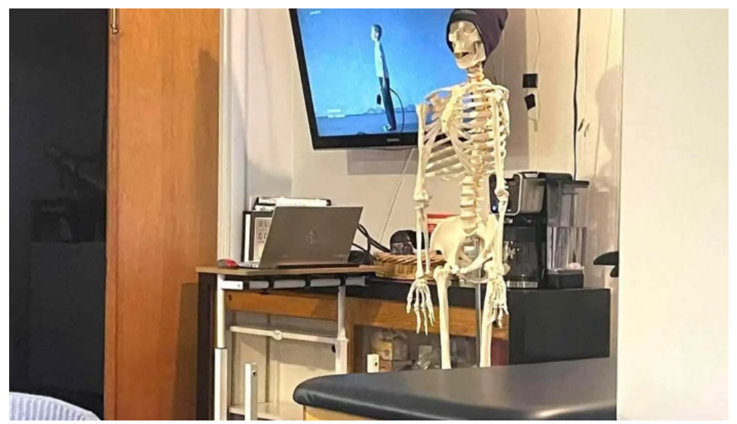
South jefferson physical therapy all