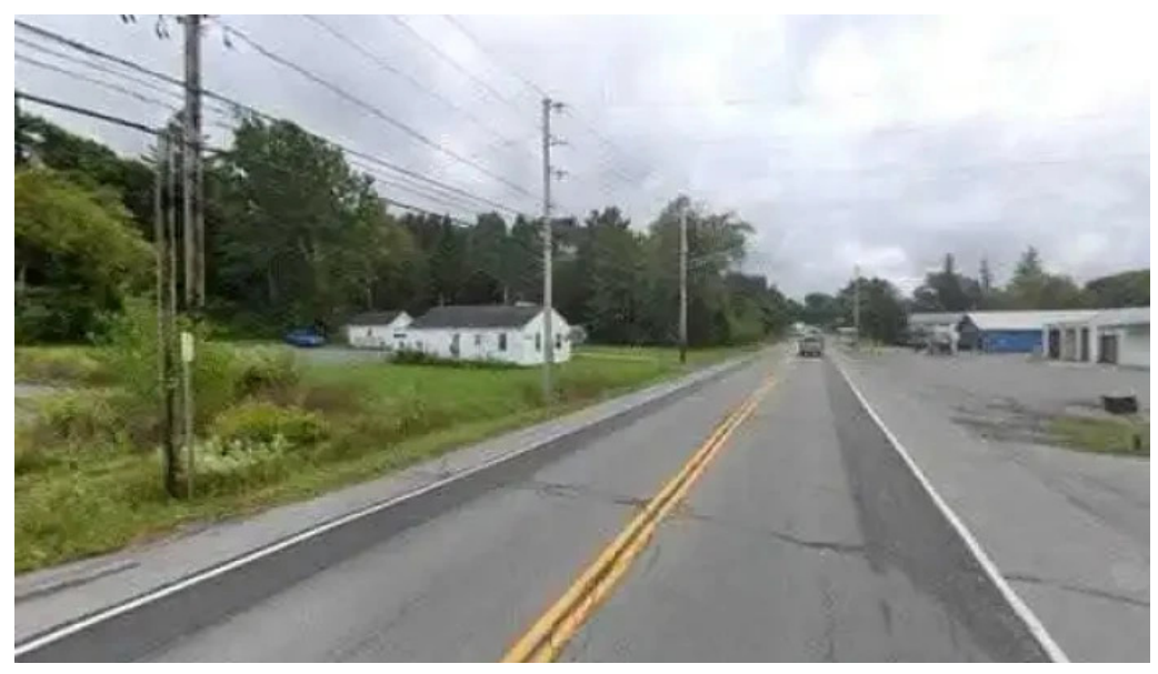
South jefferson physical therapy street view 360deg