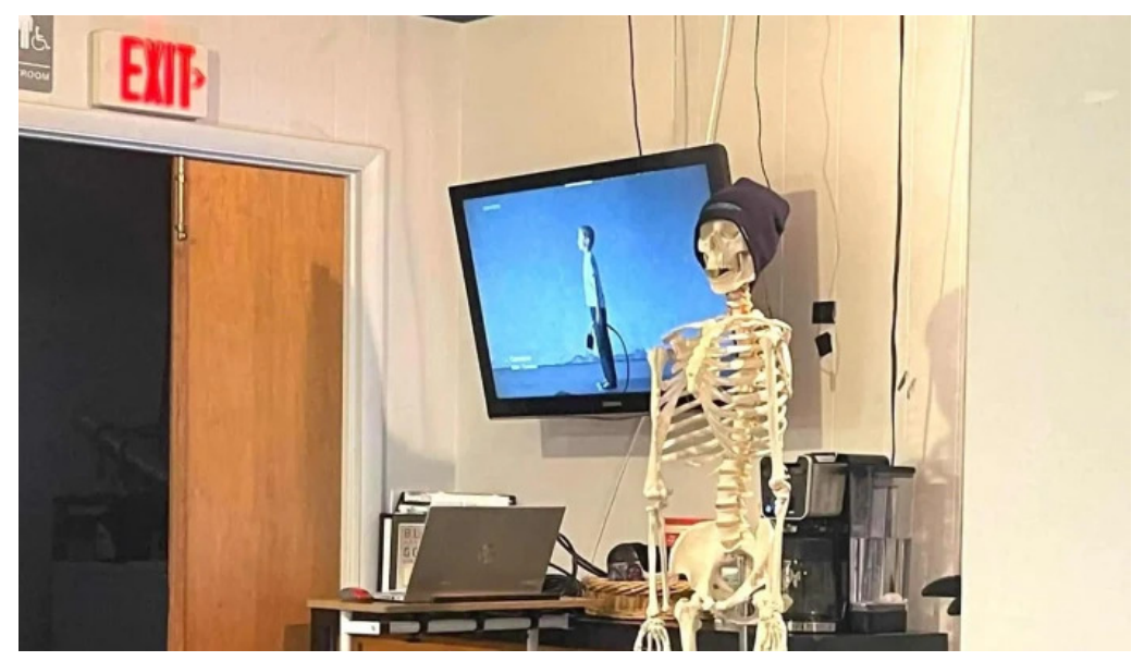
South jefferson physical therapy adams