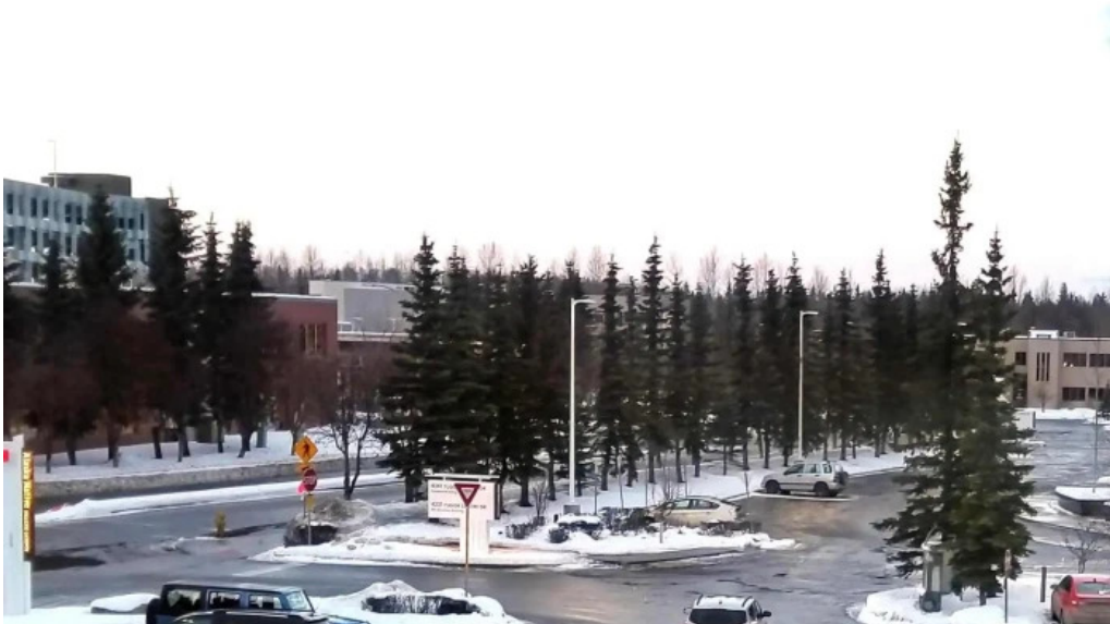
Southcentral foundation physical therapy clinic