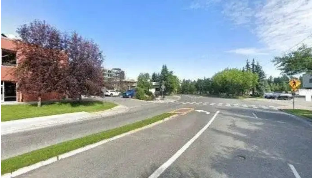
Southcentral foundation street view 360deg