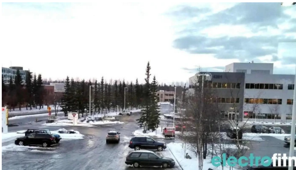
Southcentral foundation anchorage