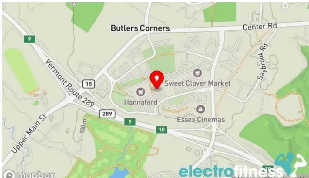
Ontrack physical therapy and functional training map