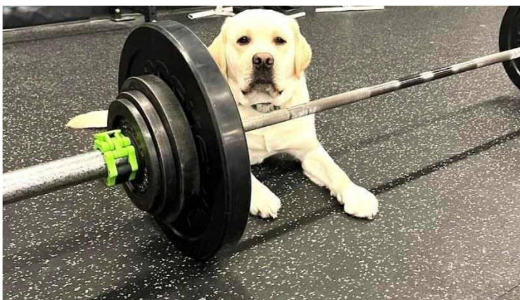
Ontrack physical therapy and functional training essex junction