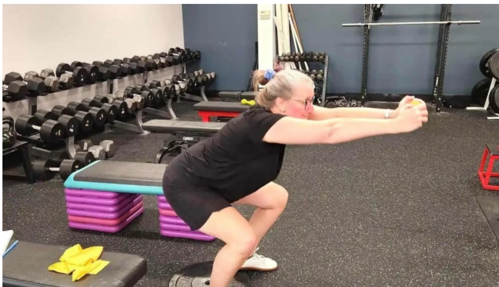
Ontrack physical therapy and functional training gym