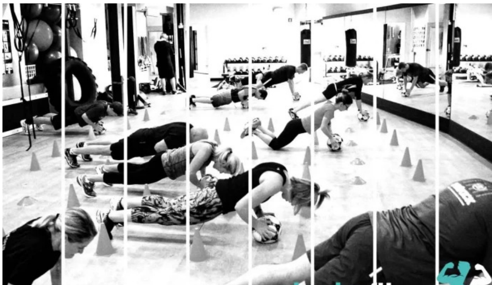
Ontrack physical therapy and functional training physical fitness