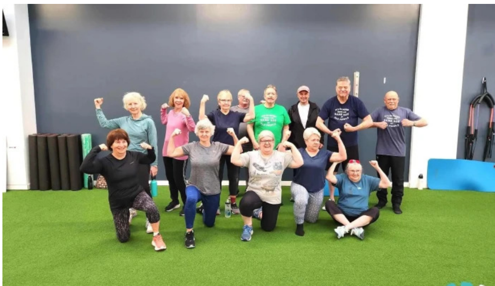
Ontrack physical therapy and functional training by owner