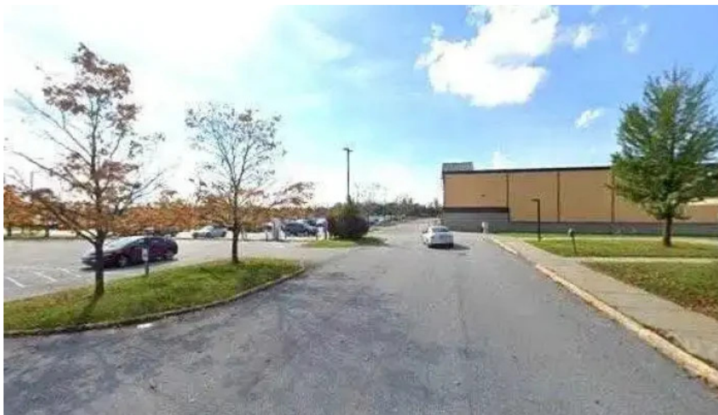
Ontrack physical therapy and functional training street view 360deg