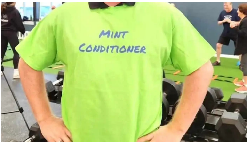
Ontrack physical therapy and functional training latest