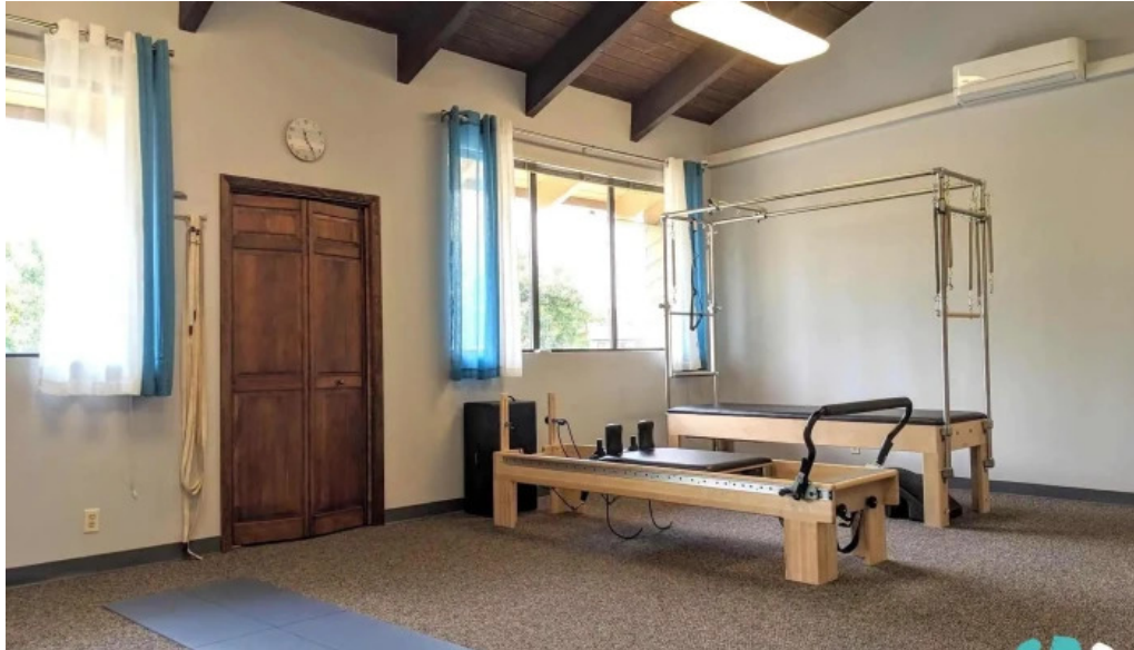
Wellness in motion llc pilates in boise idaho all