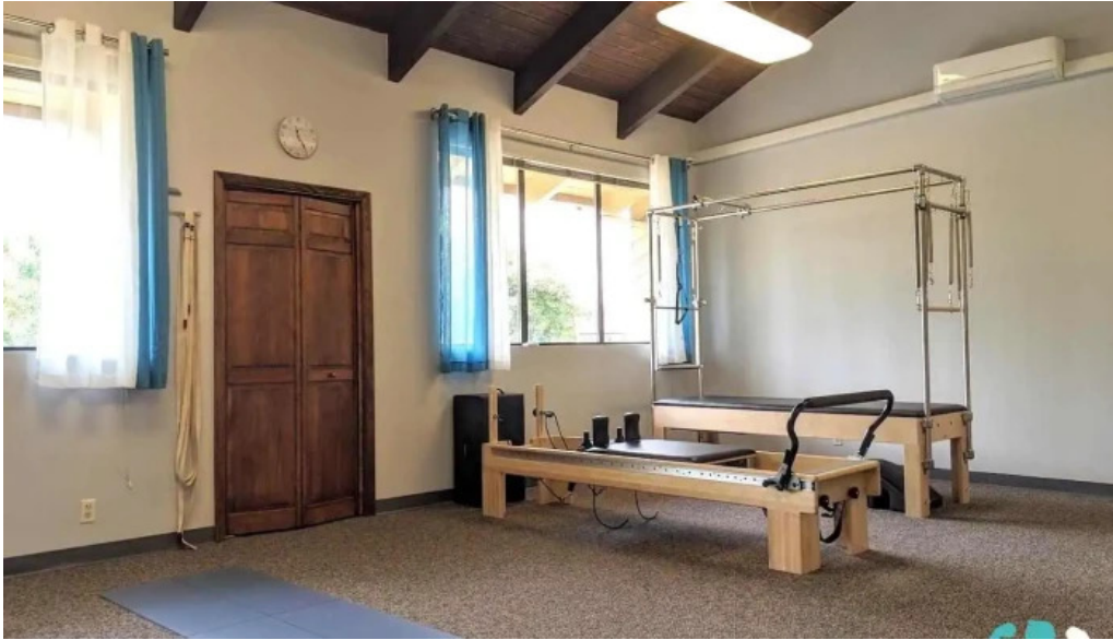
Wellness in motion llc pilates in boise idaho boise