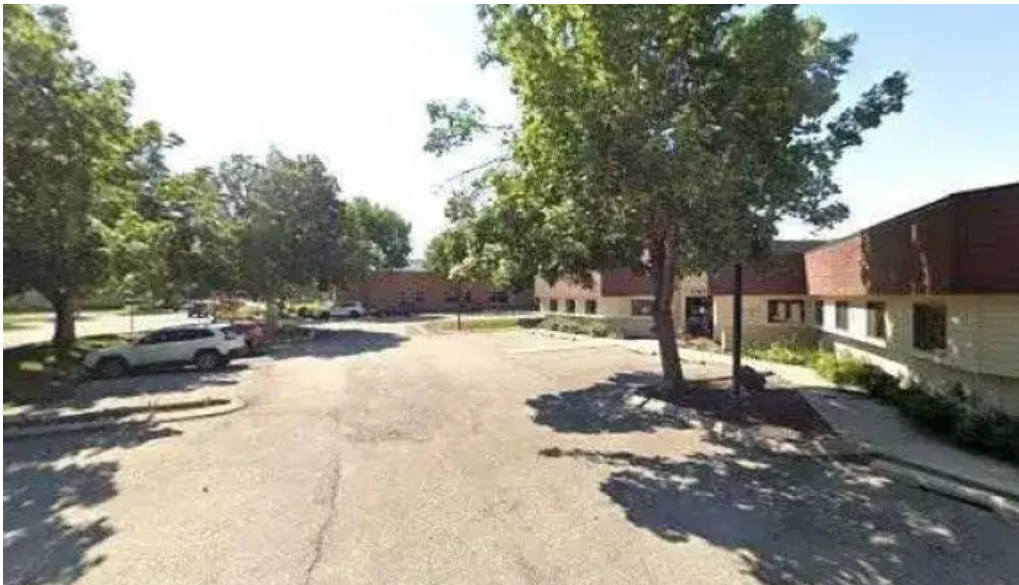
Wellness in motion llc pilates in boise idaho street view 360deg