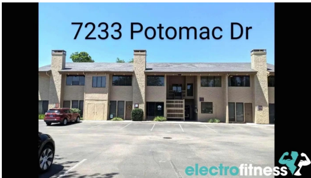
Wellness in motion llc pilates in boise idaho by owner