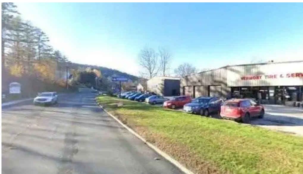
Essential physical therapy pilates street view 360deg