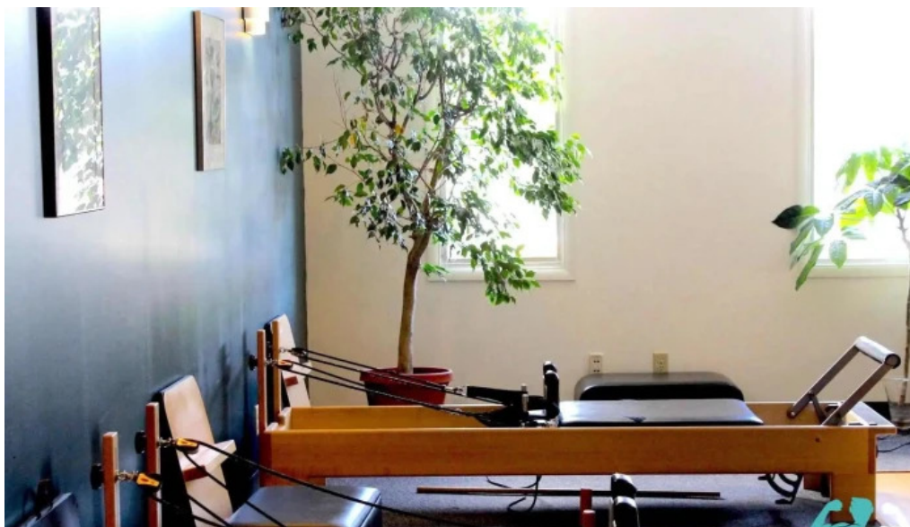
Essential physical therapy pilates all