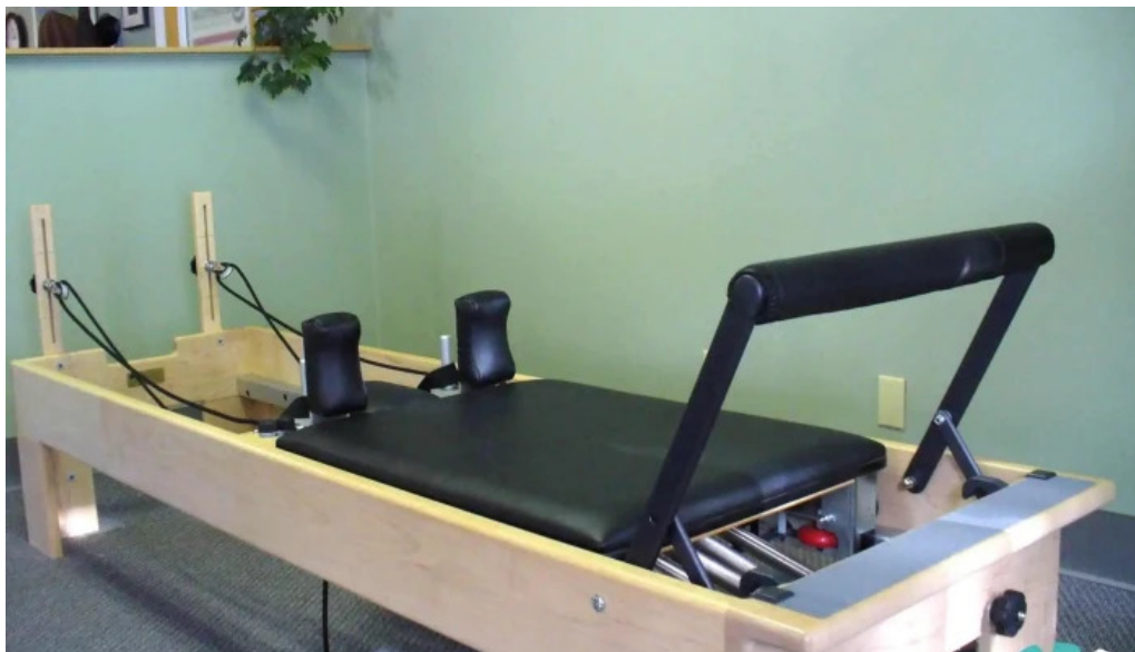
Essential physical therapy pilates by owner