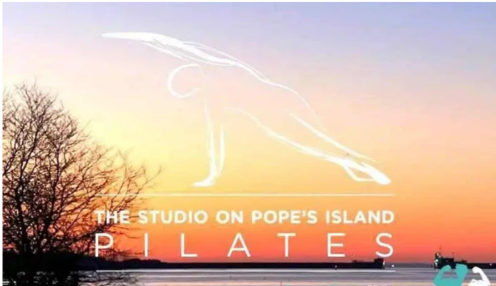
The studio on popes island all