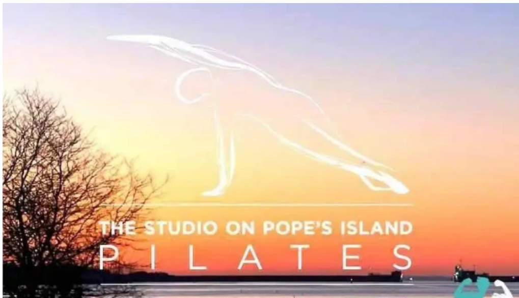
The studio on pope s island new bedford