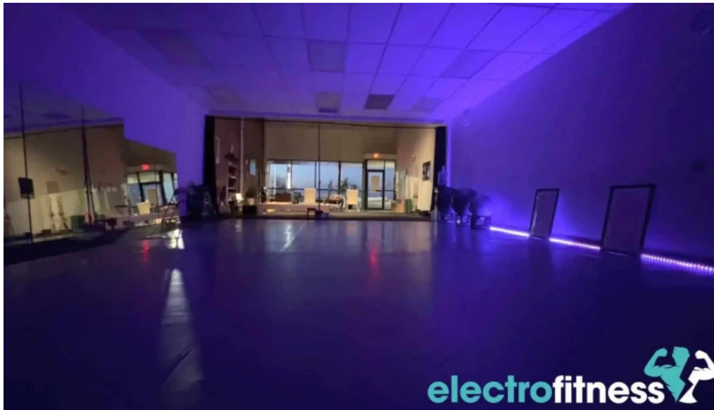
The studio on popes island videos