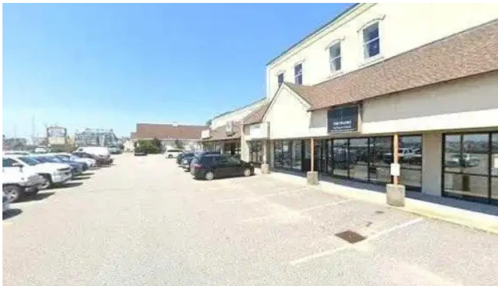
The studio on popes island street view 360deg