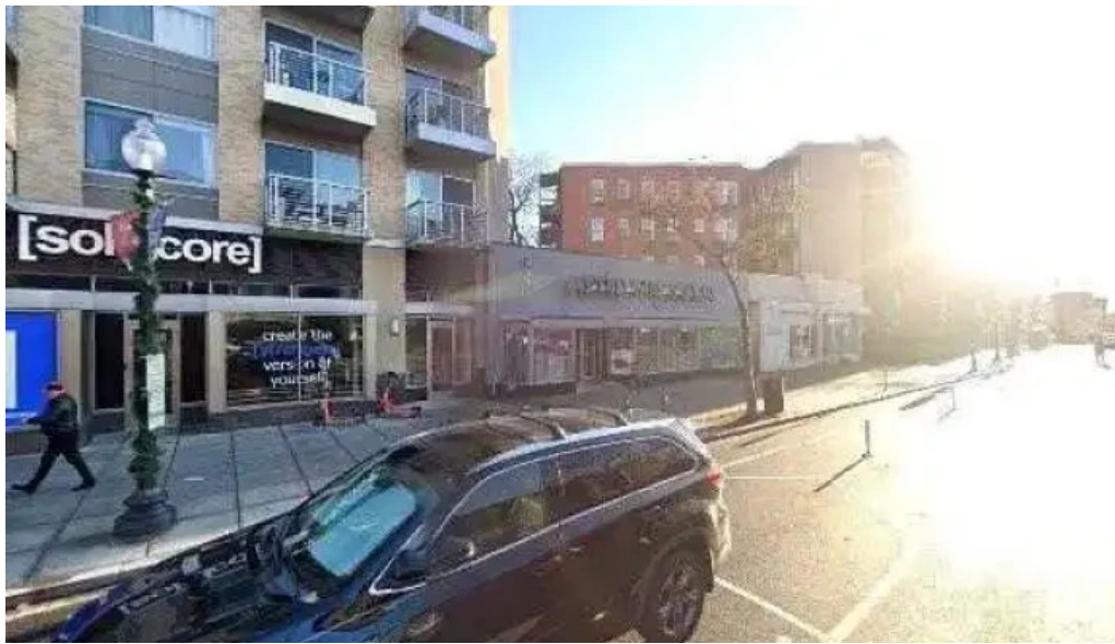
Solidcore street view 360deg