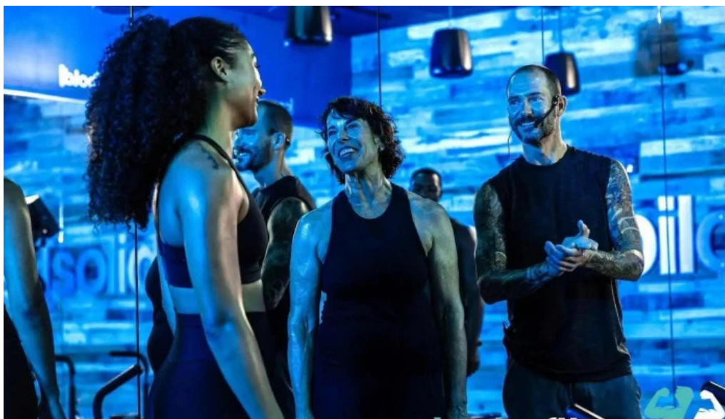
Solidcore by owner