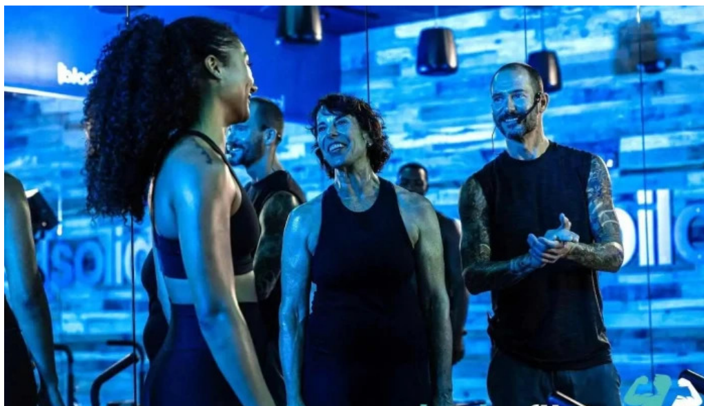
Solidcore by owner