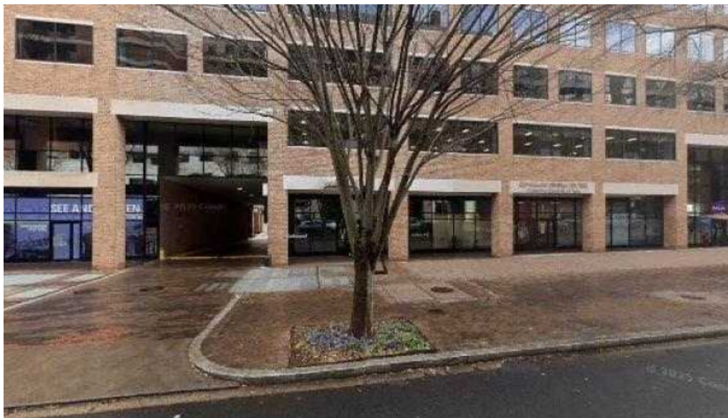
Solidcore street view 360deg