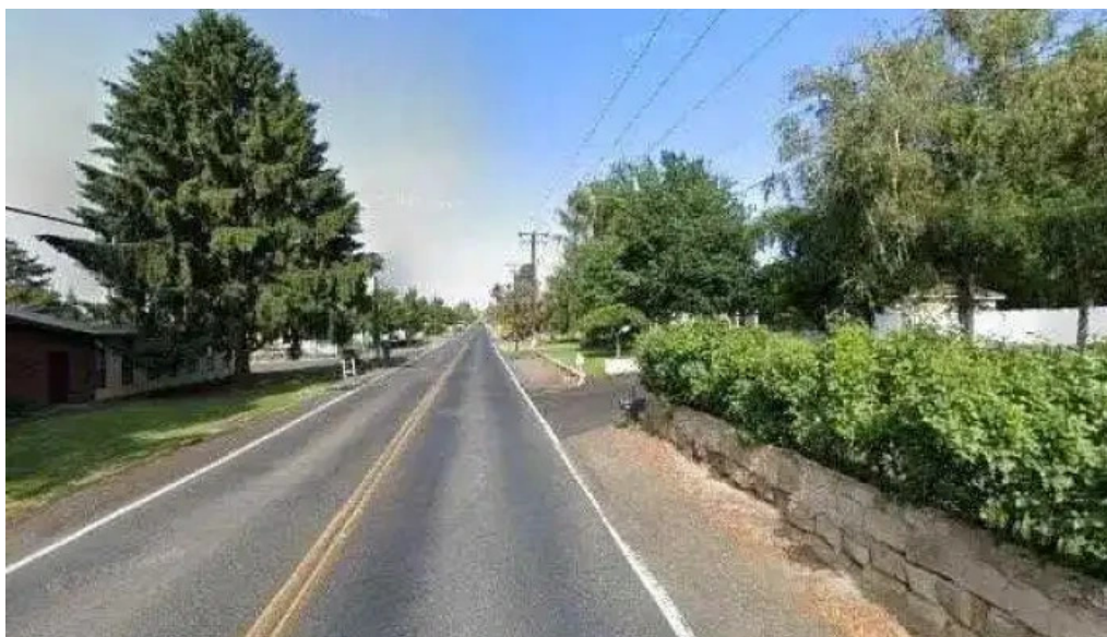
Premier fitness studio all