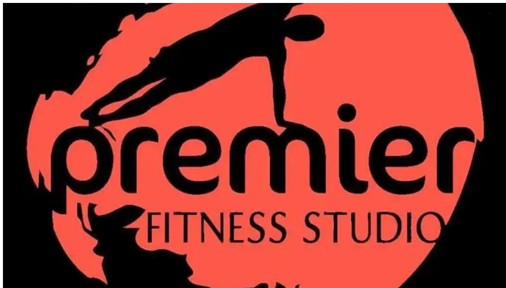
Premier fitness studio by owner