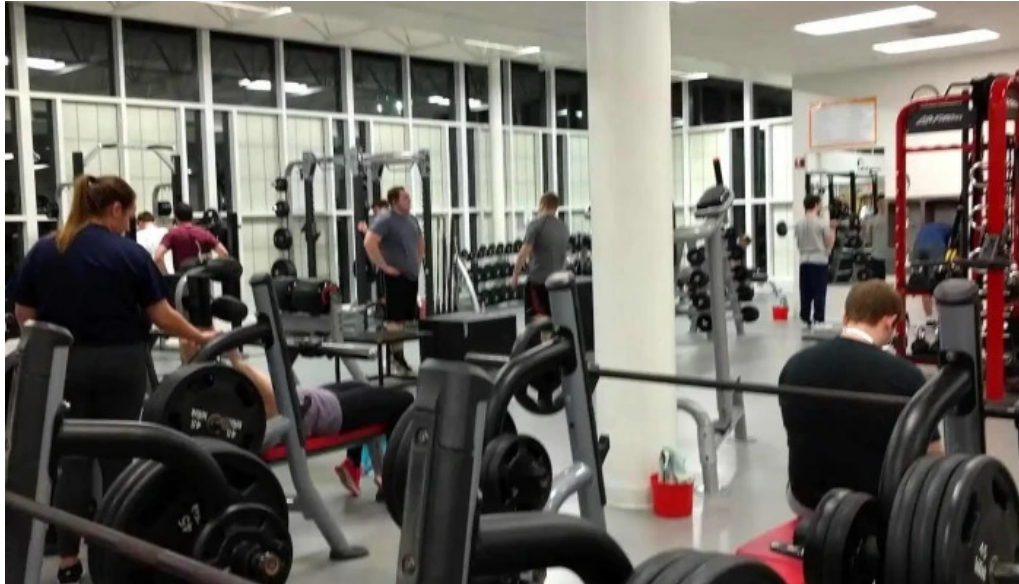
Student recreation center all