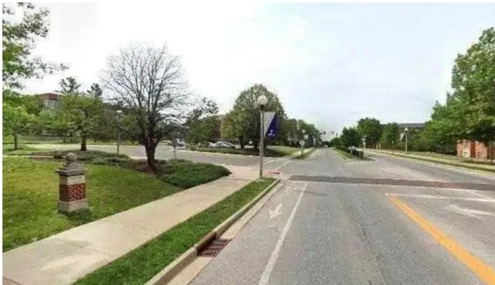
Student recreation center street view 360deg