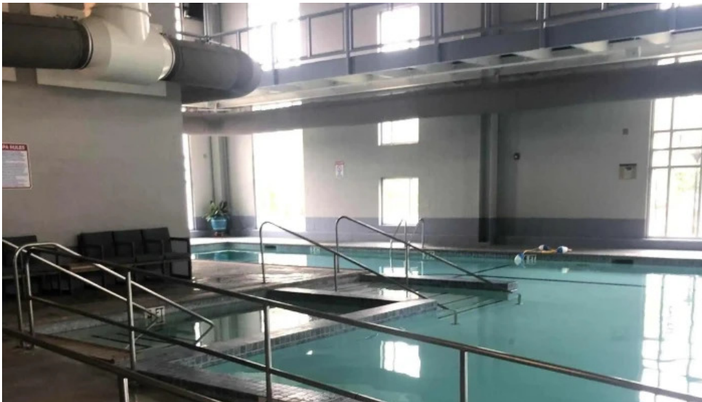
Angelina rehabilitation center rehabilitation center