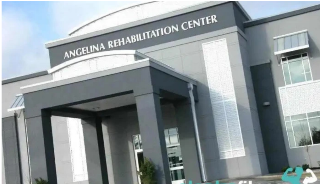
Angelina rehabilitation center all