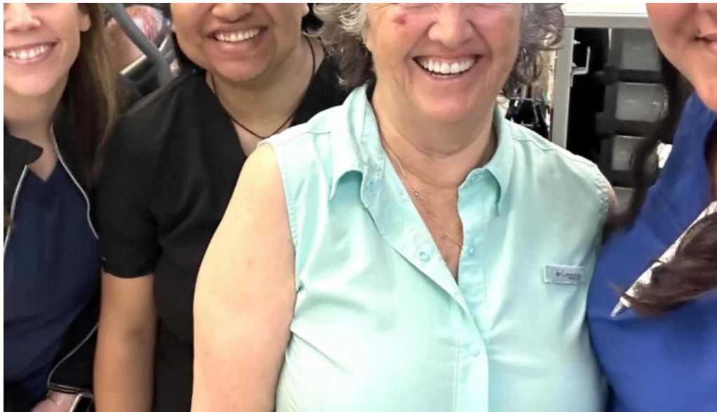
Angelina rehabilitation center photos