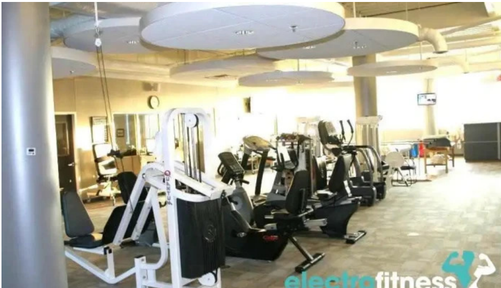
Angelina rehabilitation center by owner