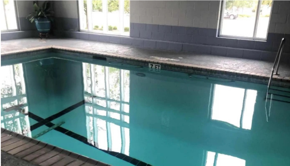
Angelina rehabilitation center lufkin