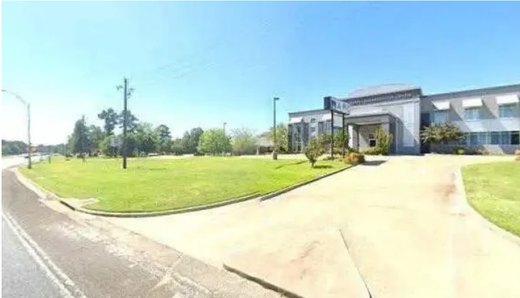
Angelina rehabilitation center street view 360deg