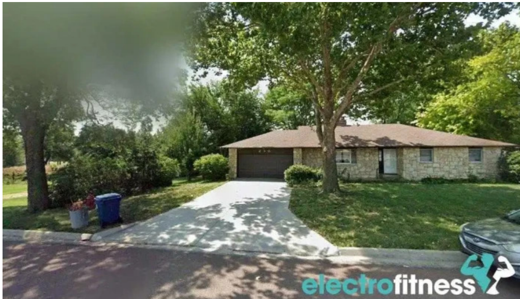
Wabaunsee usd 329 alma