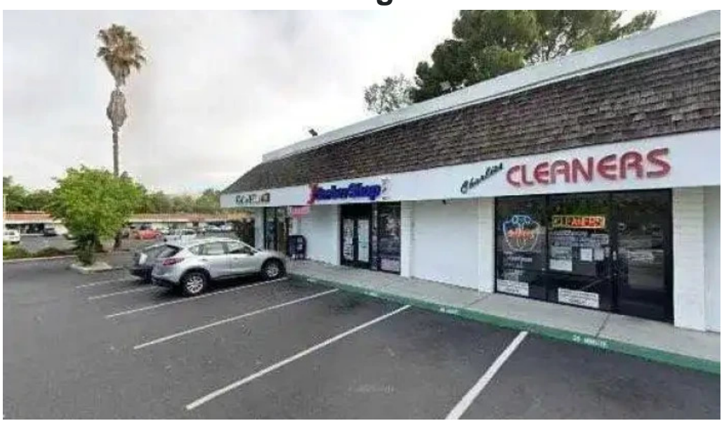
Cantrelles martial arts street view 360deg