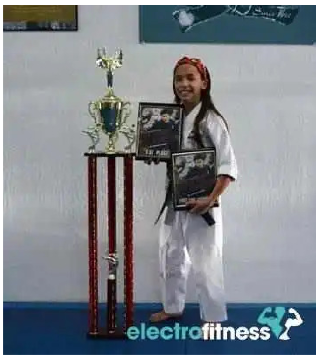
Cantrelles martial arts martial art