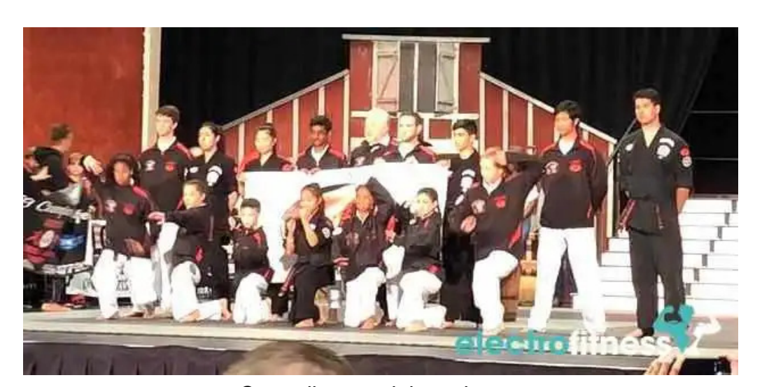
Cantrelles martial arts by owner