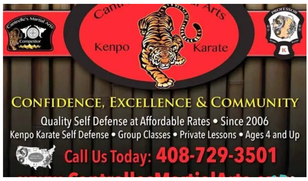
Cantrelles martial arts all