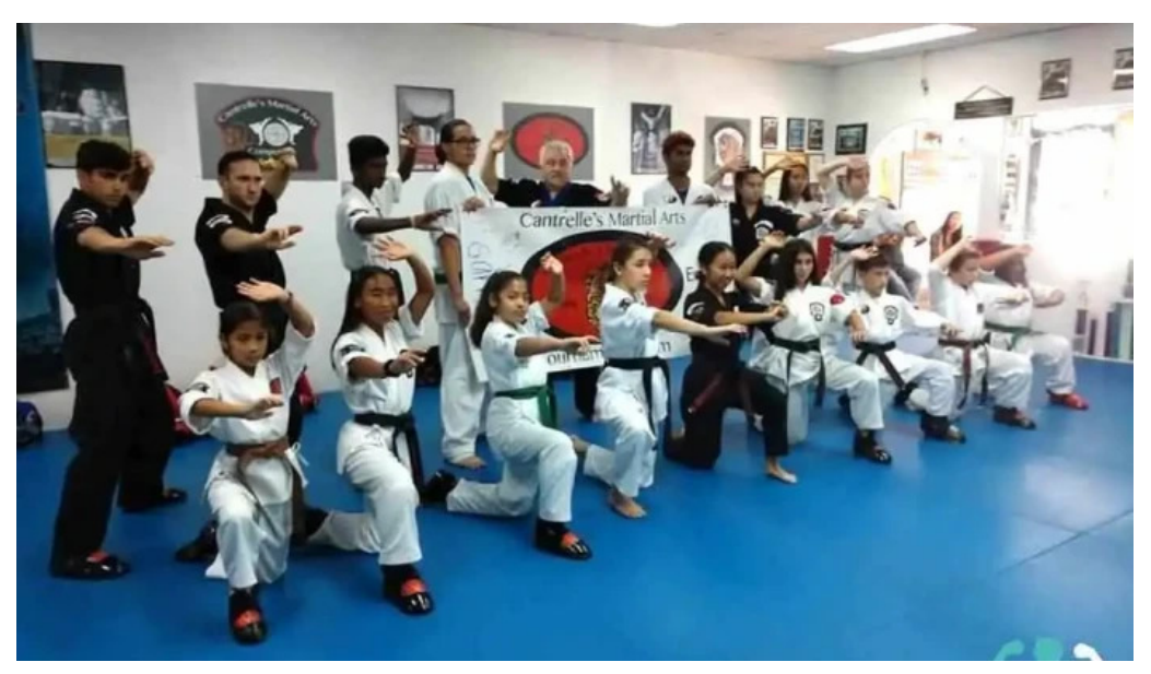
Cantrelles martial arts community