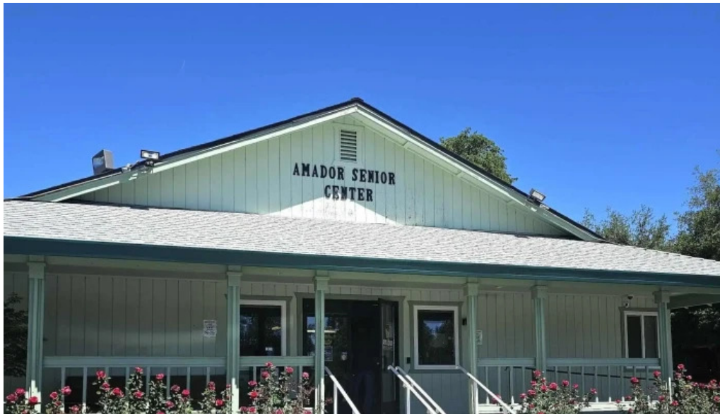
Amador senior center senior citizen center