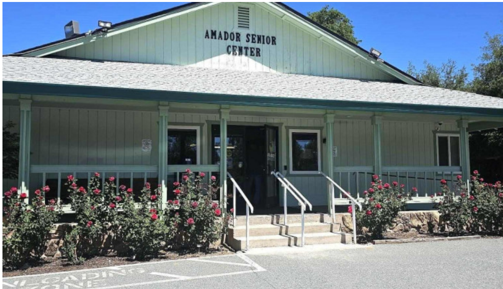
Amador senior center exterior