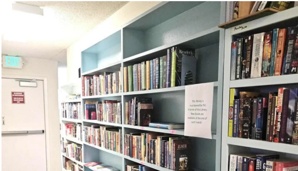
Amador senior center jackson