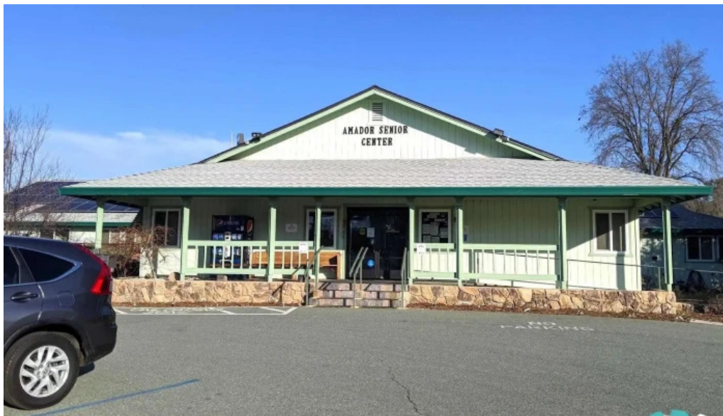
Amador senior center all