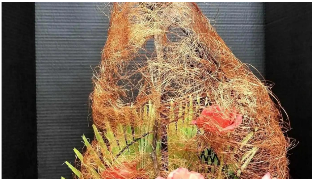
Amador senior center from visitors