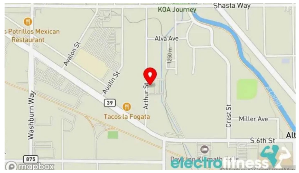
Klamath basin senior citizens center map