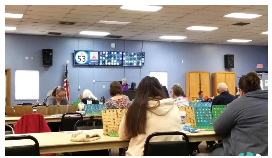
Klamath basin senior citizens center from visitors