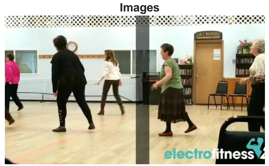
Klamath basin senior citizens center videos

If you wish to adjust any detail that you consider is not precise related to this site, we ask forward a message so that we will adjust it promptly. In advance thanks.