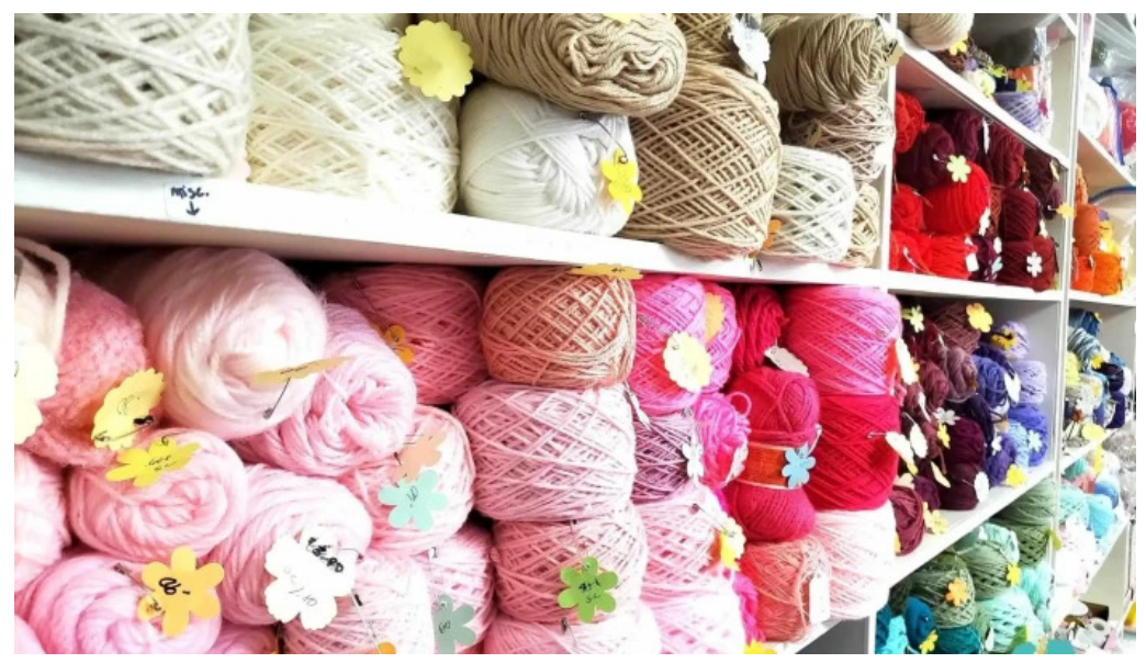
Klamath basin senior citizens center food drink