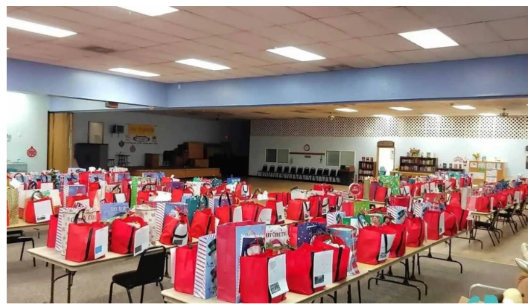
Klamath basin senior citizens center amenities