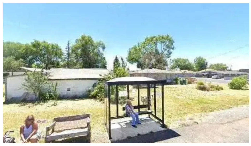
Klamath basin senior citizens center street view 360deg