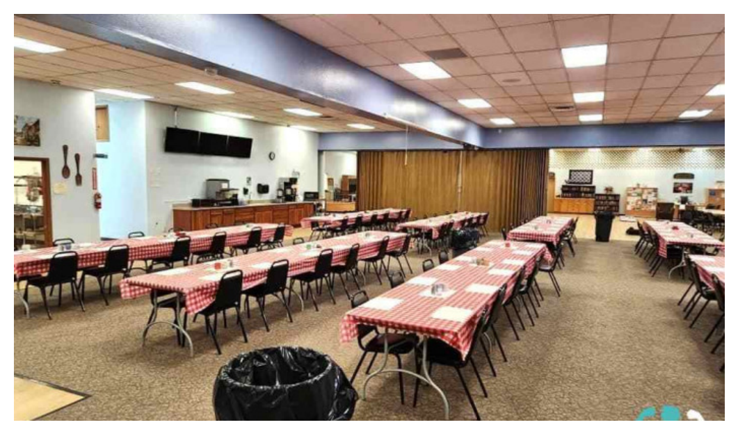
Klamath basin senior citizens center by owner