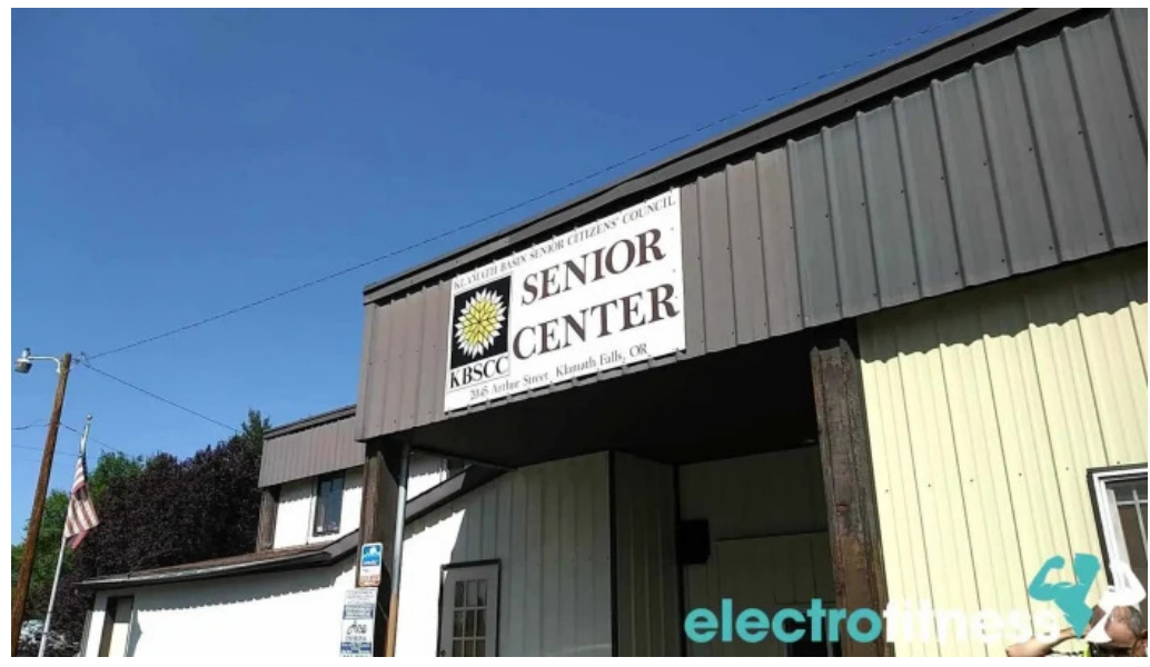
Klamath basin senior citizens center klamath falls