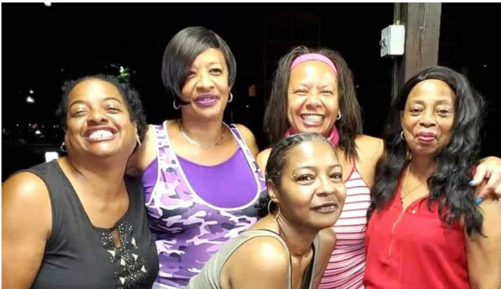
South cumberland marketplace where