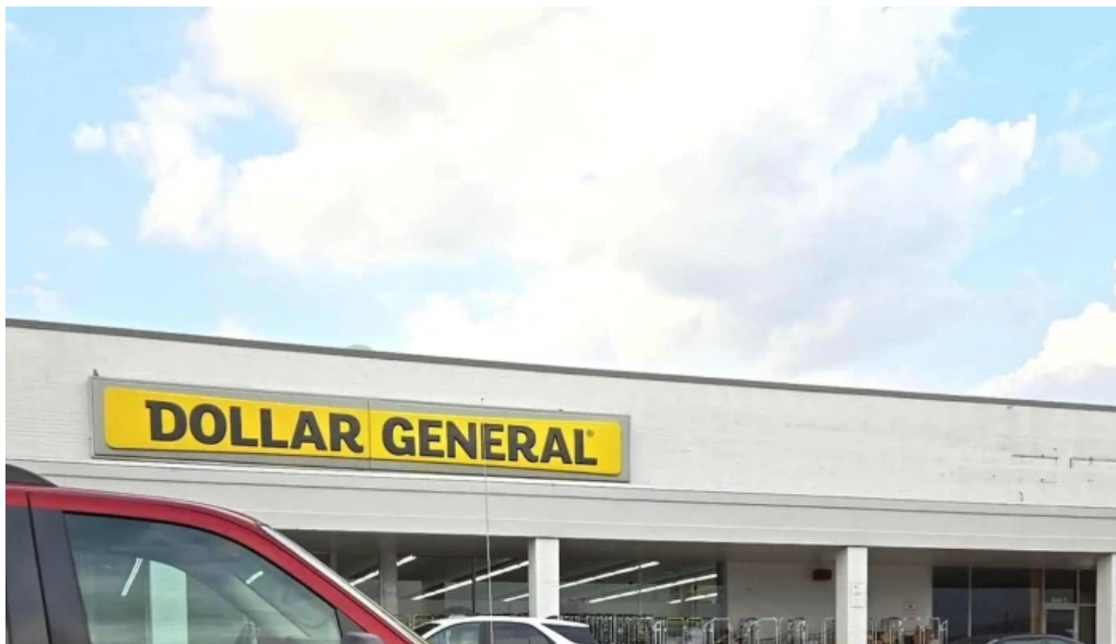
South cumberland marketplace shopping mall