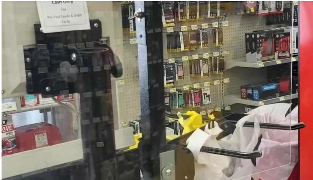
South cumberland marketplace inside