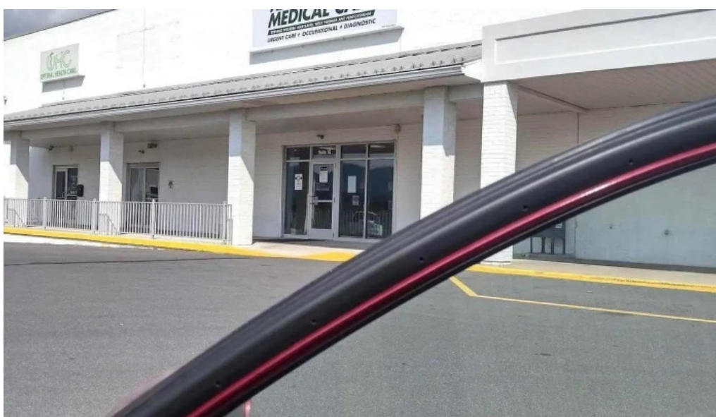
South cumberland marketplace all