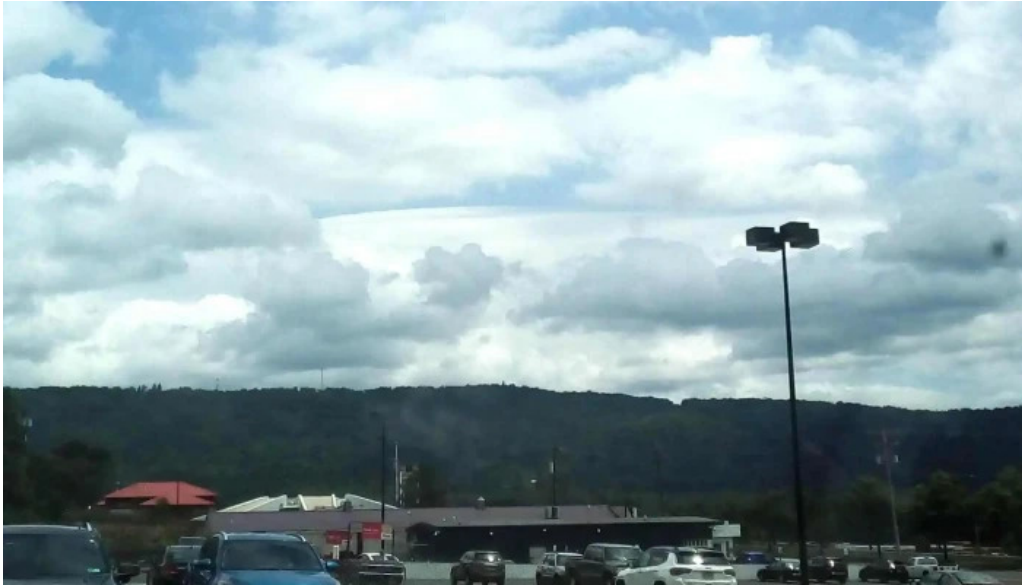
South cumberland marketplace promotion