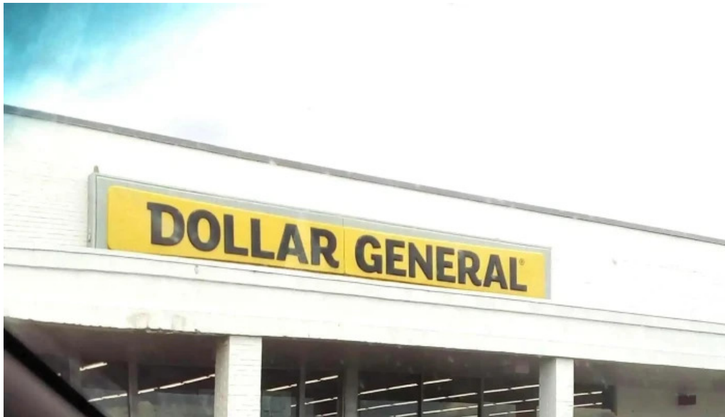
South cumberland marketplace website