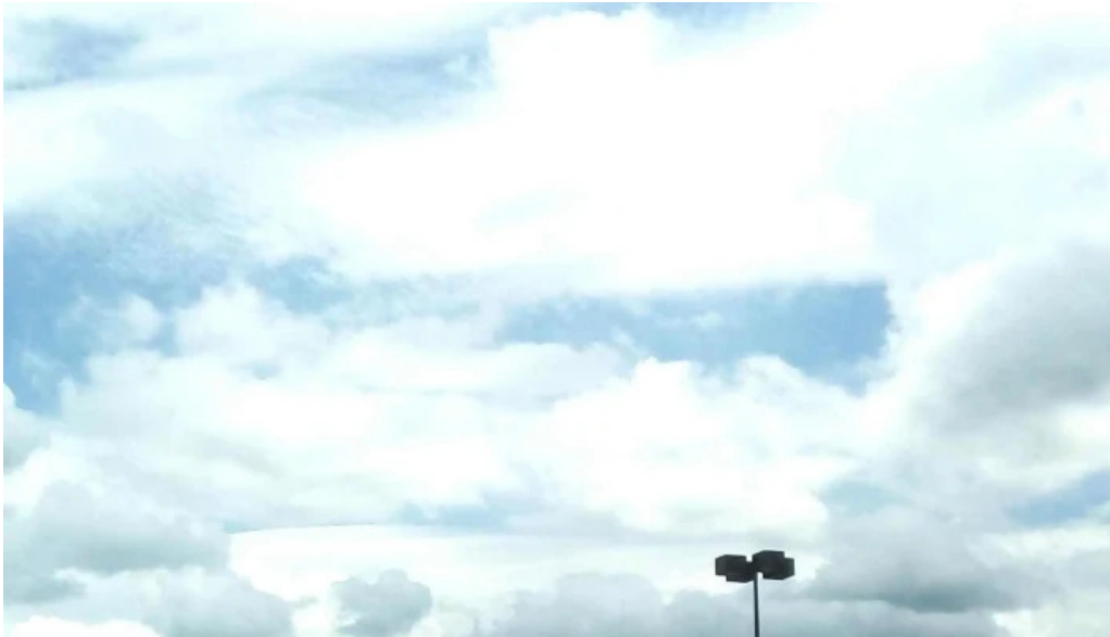
South cumberland marketplace photos