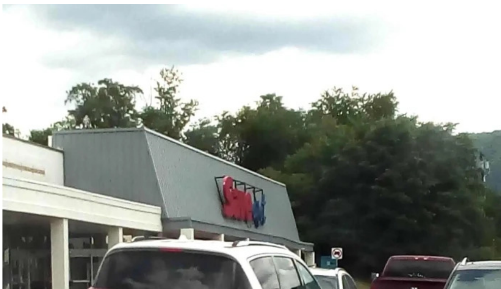
South cumberland marketplace cumberland