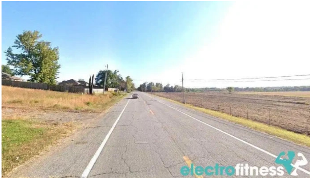
Overtime athletics training facility alma