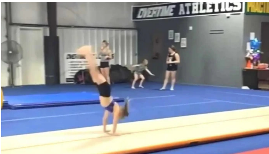
Overtime athletics training facility by owner