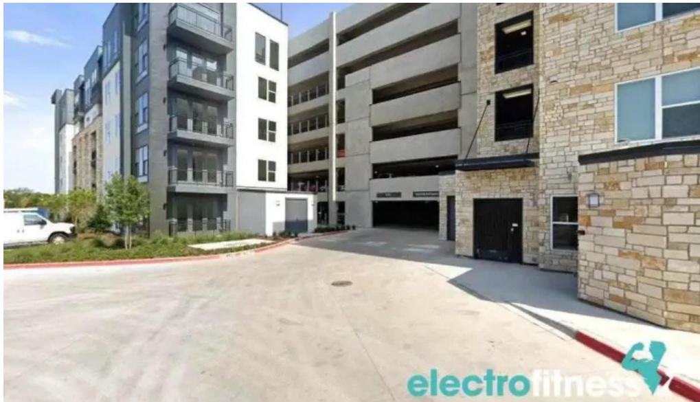
Athena fit training weight loss addison addison