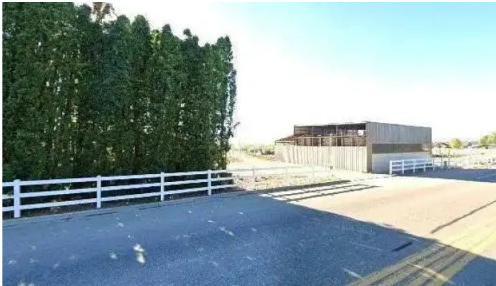
Boise barbell street view 360deg