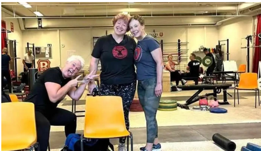
Boise barbell all