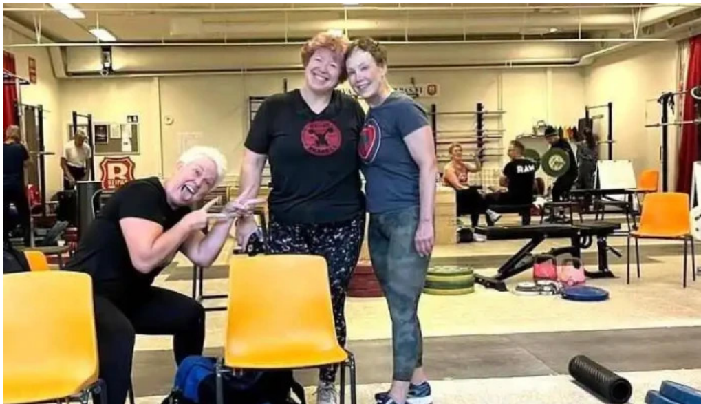
Boise barbell boise