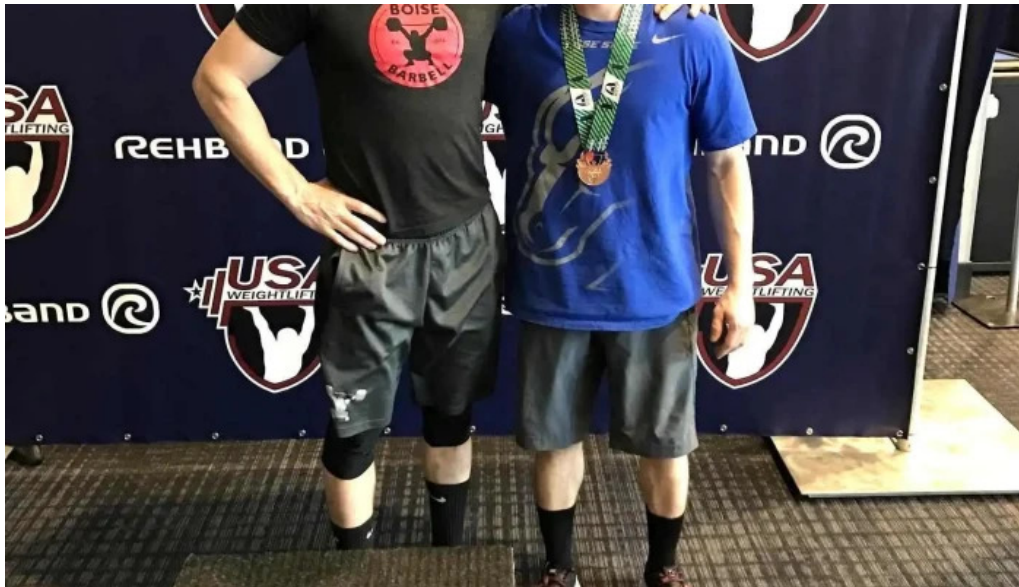
Boise barbell by owner