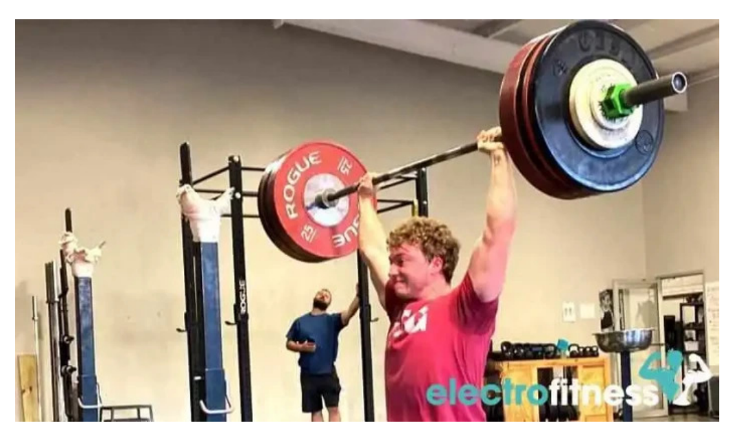
Bowling green barbell club all