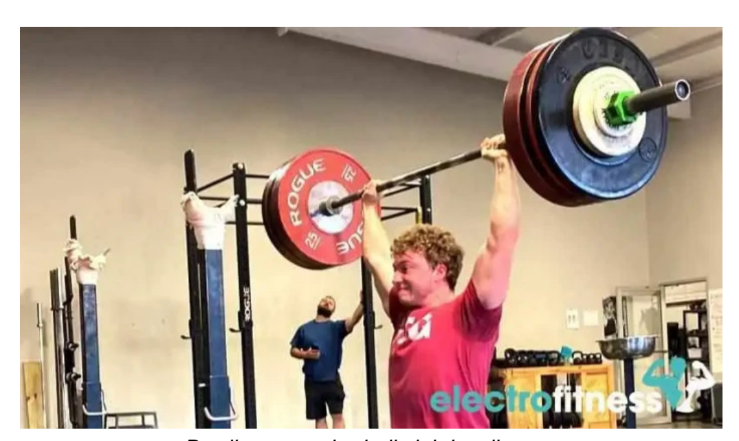
Bowling green barbell club bowling green