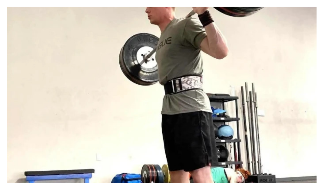
Bowling green barbell club by owner