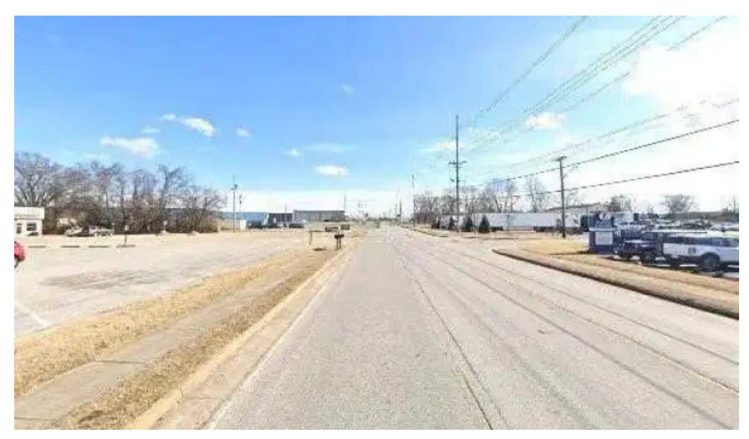
Bowling green barbell club street view 360deg