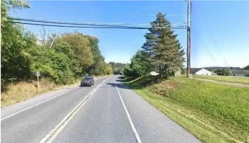
Pinnacle strength and fitness street view 360deg