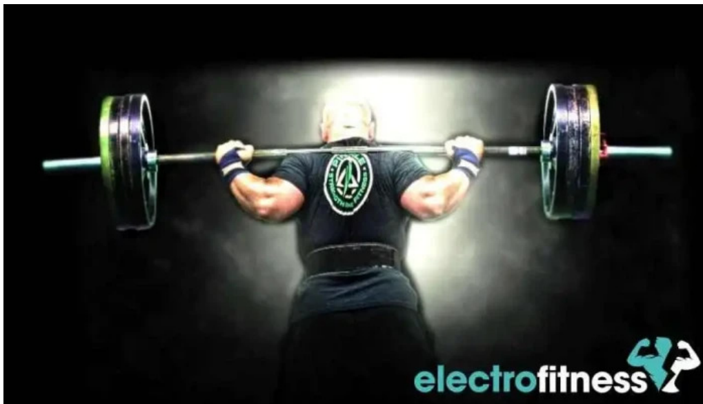
Pinnacle strength and fitness by owner