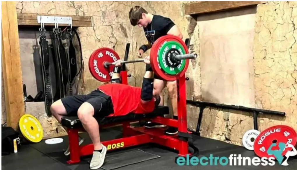
Pinnacle strength and fitness denver