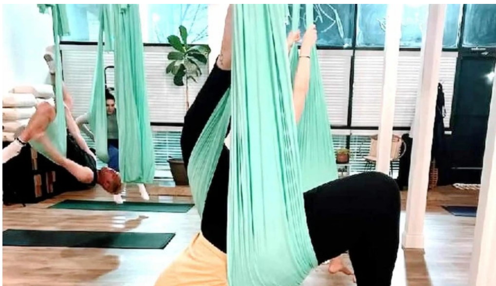
The nightingale catalog