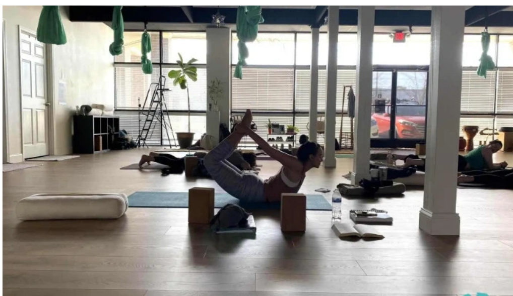
The nightingale all