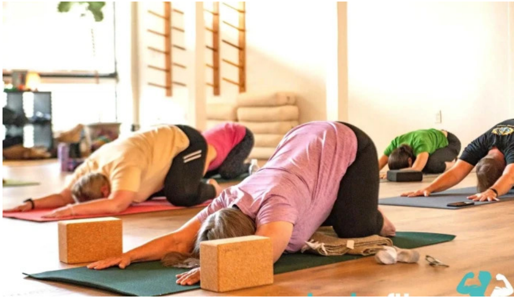
The nightingale yoga