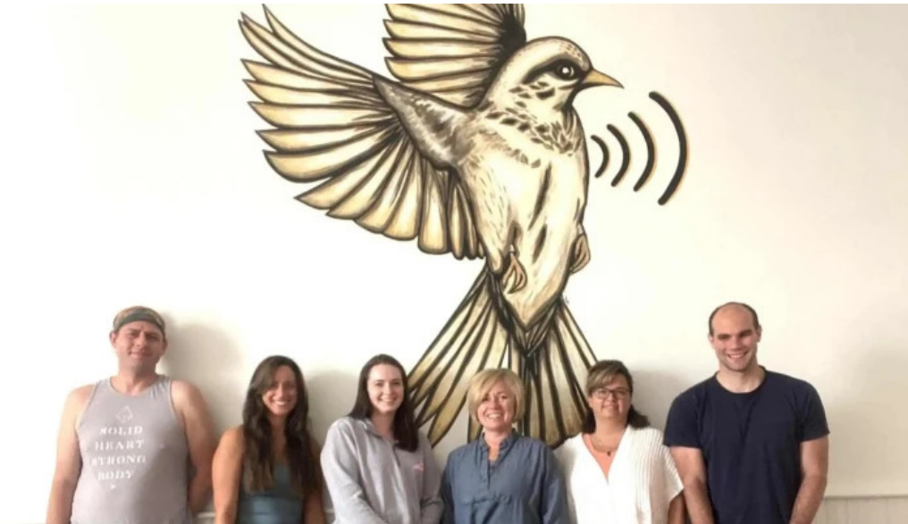
The nightingale videos