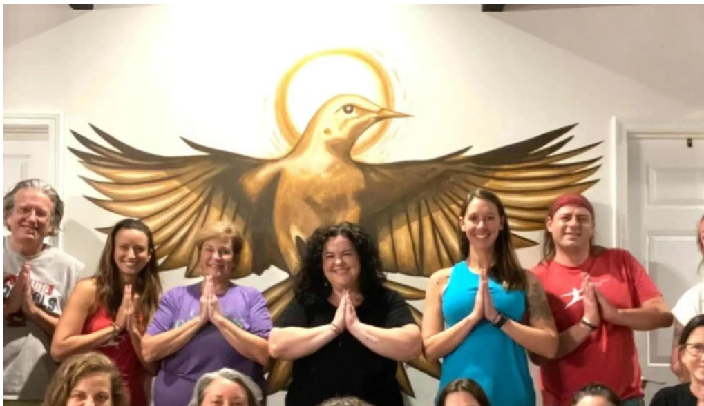
The nightingale promotion