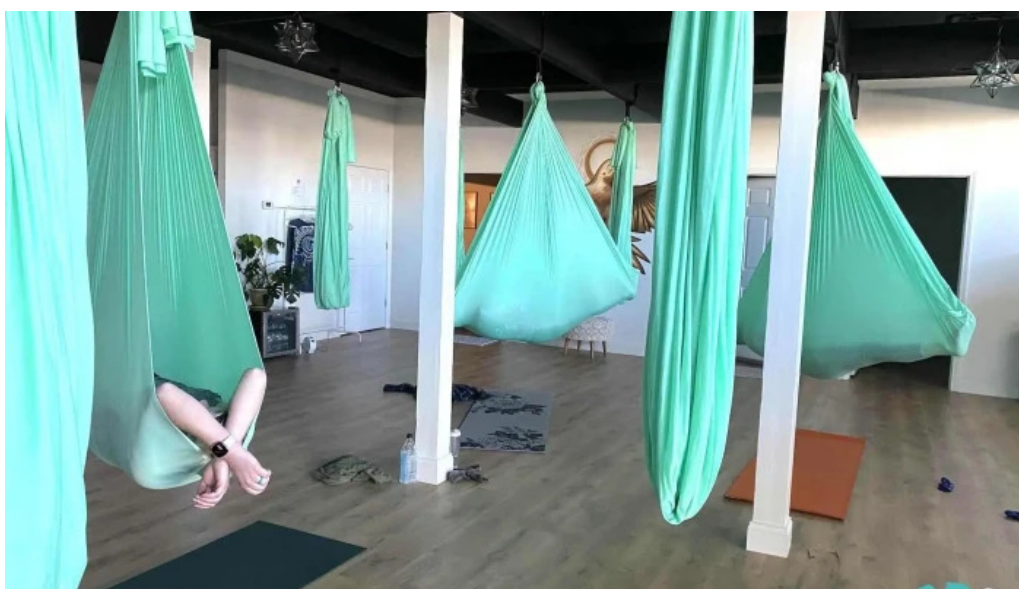
The nightingale by owner