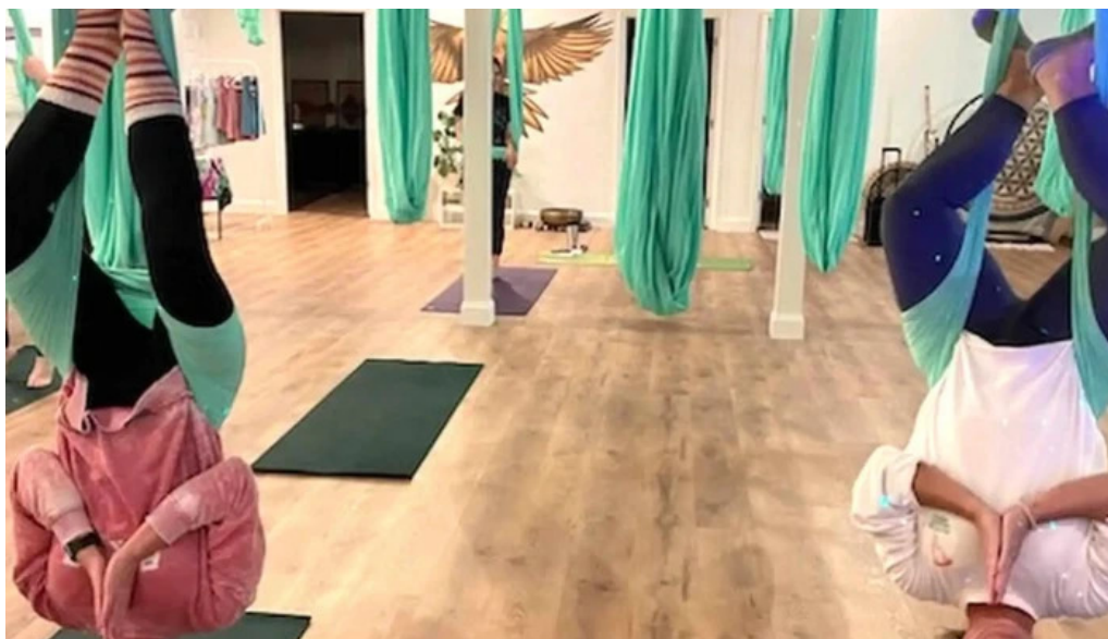
The nightingale bowling green