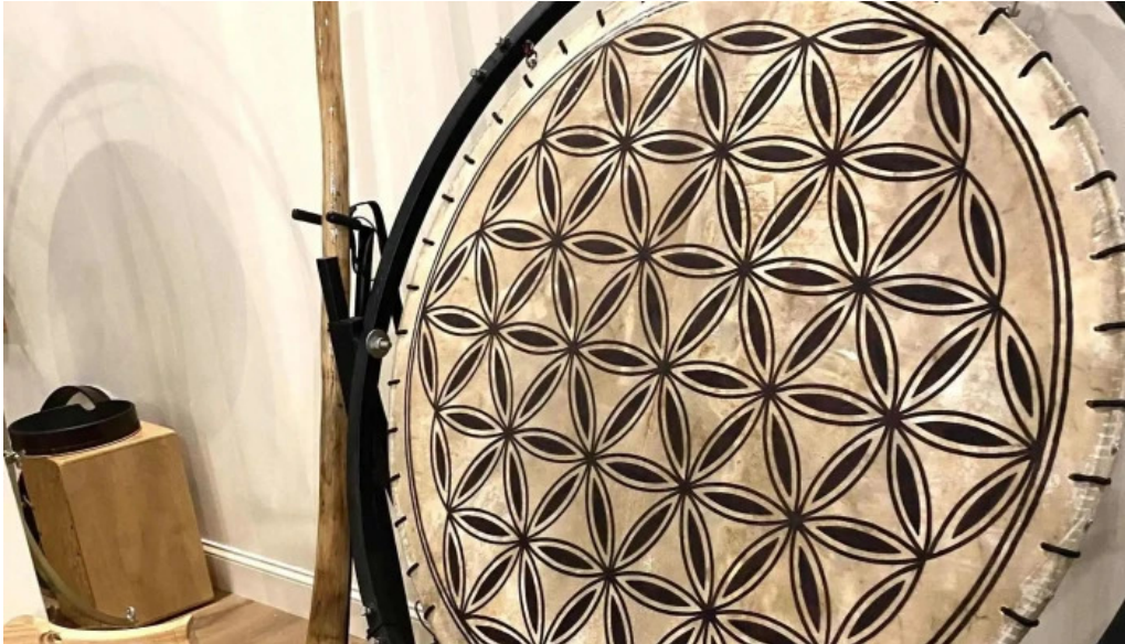
The nightingale phone