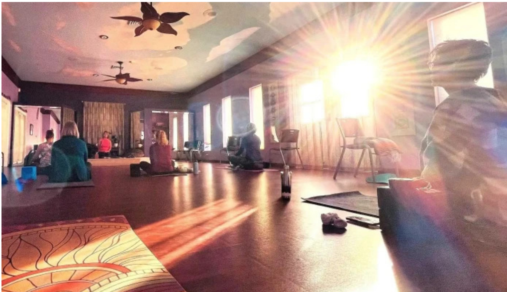
Rise yoga gettysburg by owner