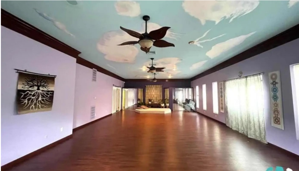
Rise yoga gettysburg gettysburg