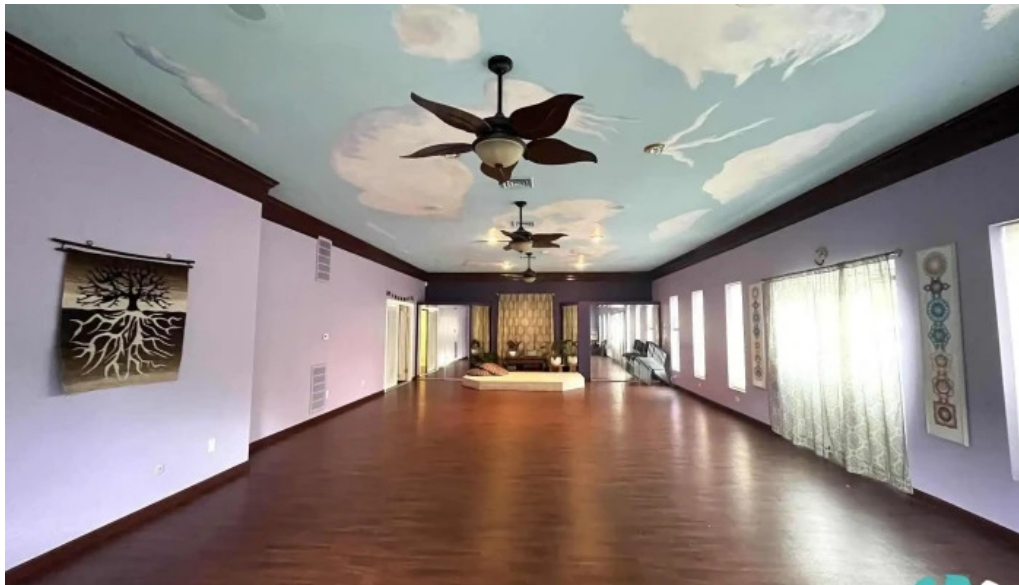
Rise yoga gettysburg all