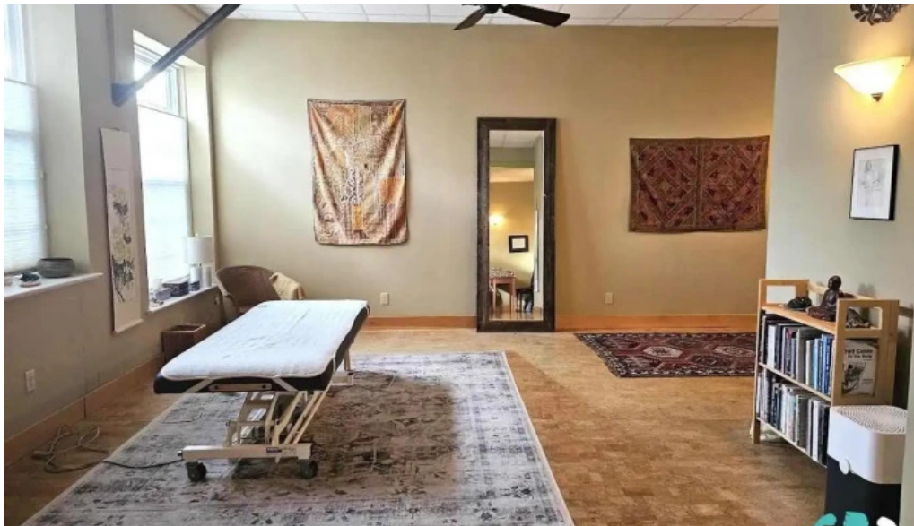
Yoga grace middlebury