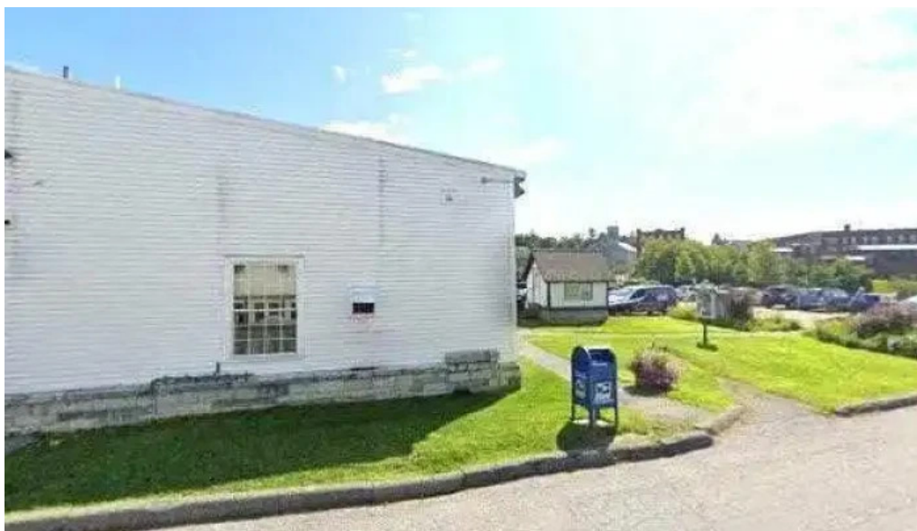
Yoga grace street view 360deg