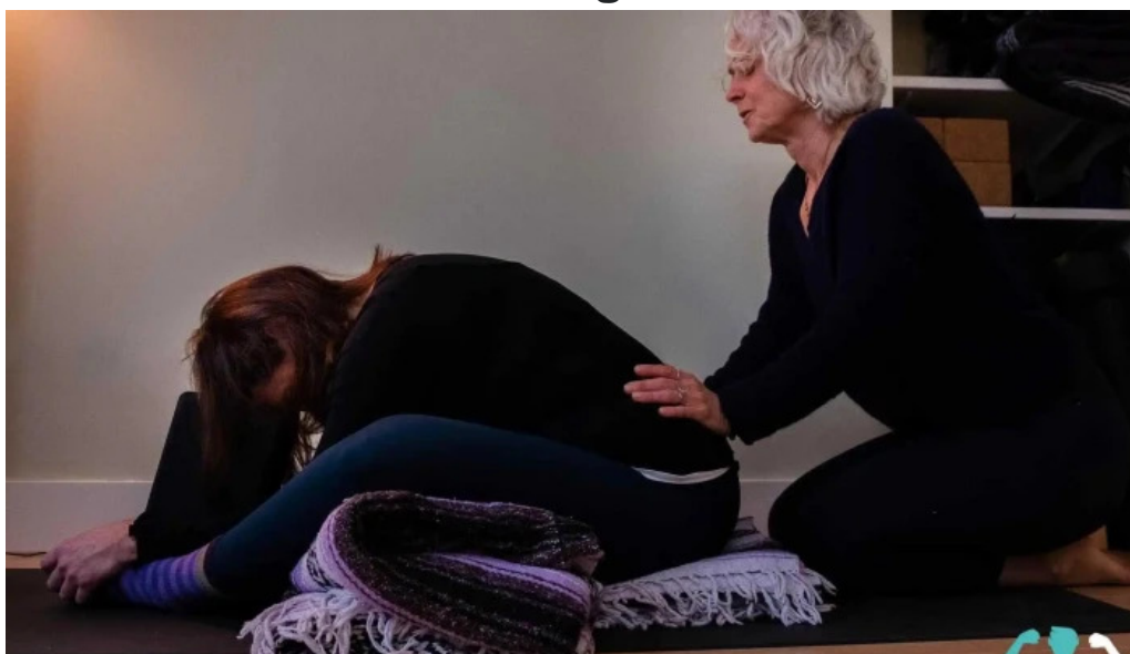
Yoga grace yoga