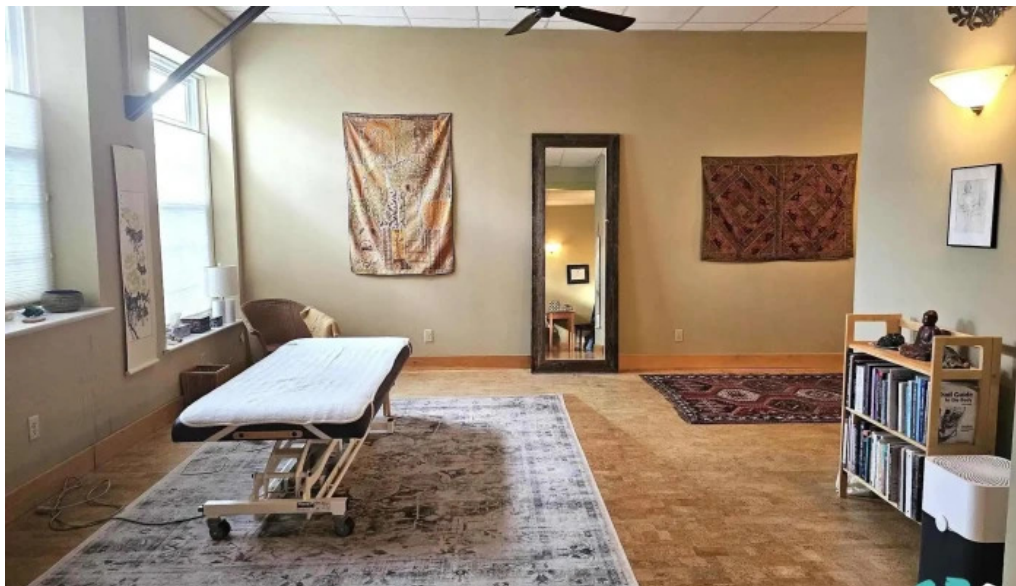
Yoga grace all