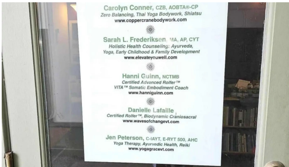
Yoga grace by owner