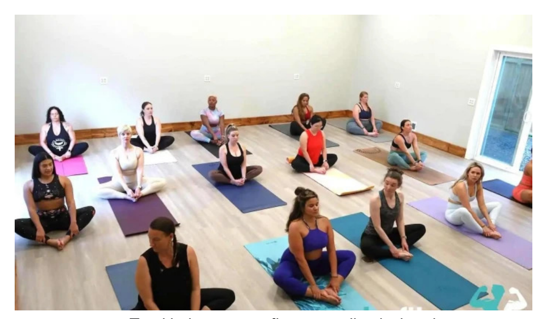
Total balance yoga fitness studio pittsburgh