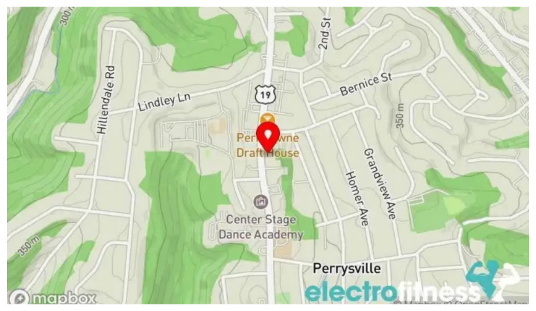
Total balance yoga fitness studio map