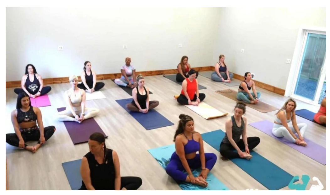
Total balance yoga fitness studio all