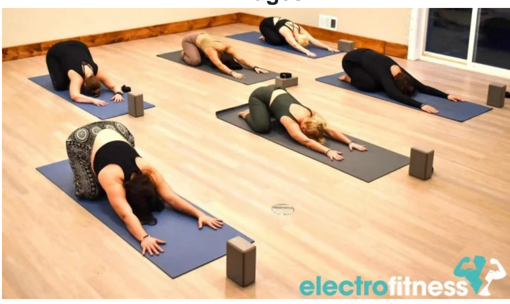
Total balance yoga fitness studio yoga