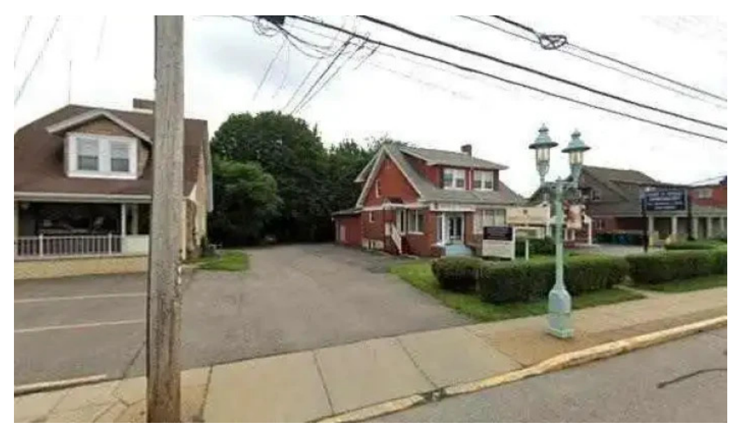
Total balance yoga fitness studio street view 360deg