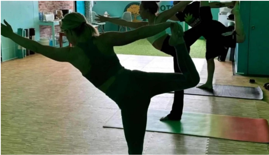
Rooted yoga quincy yoga studio