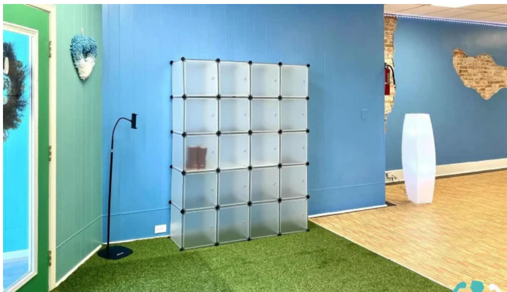
Rooted yoga quincy by owner