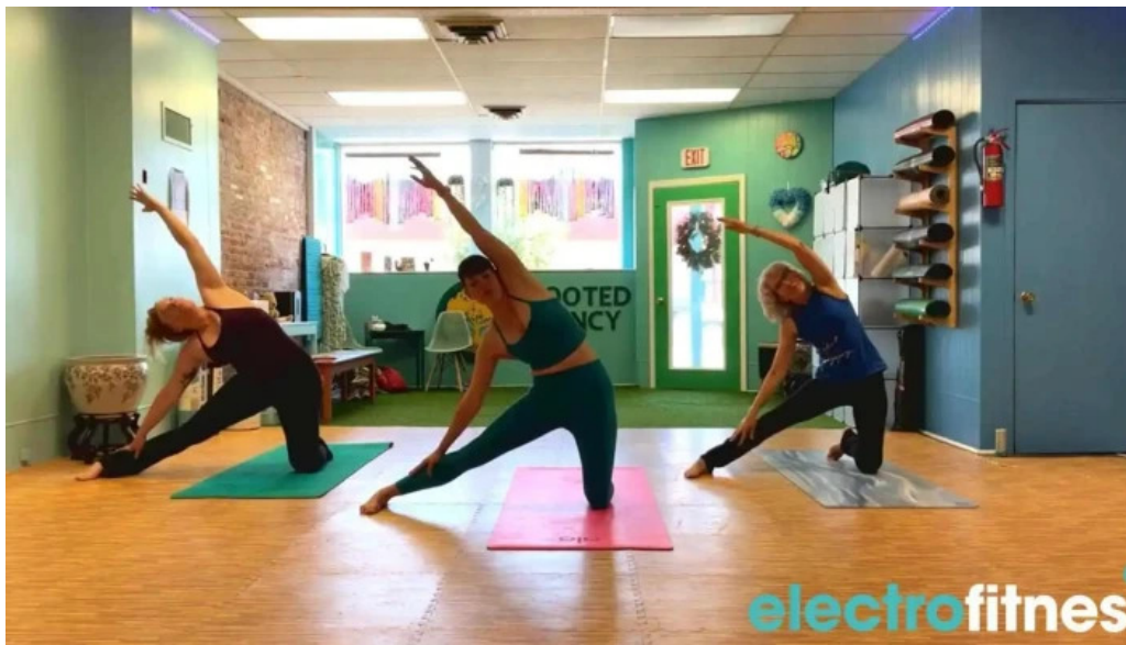
Rooted yoga quincy quincy