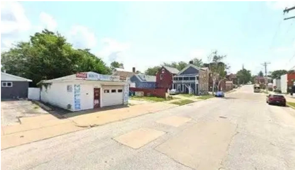
Rooted yoga quincy street view 360deg