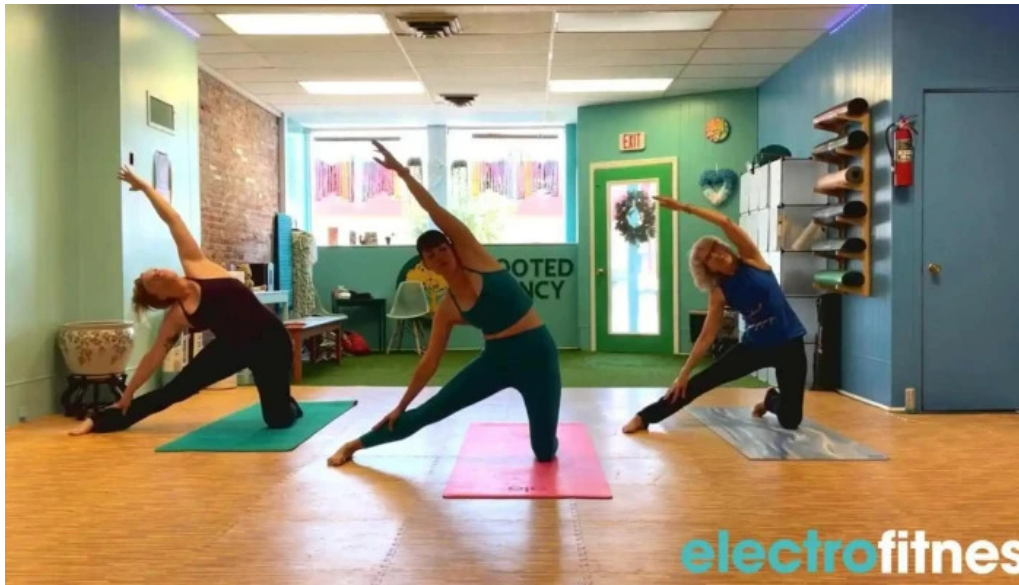
Rooted yoga quincy all