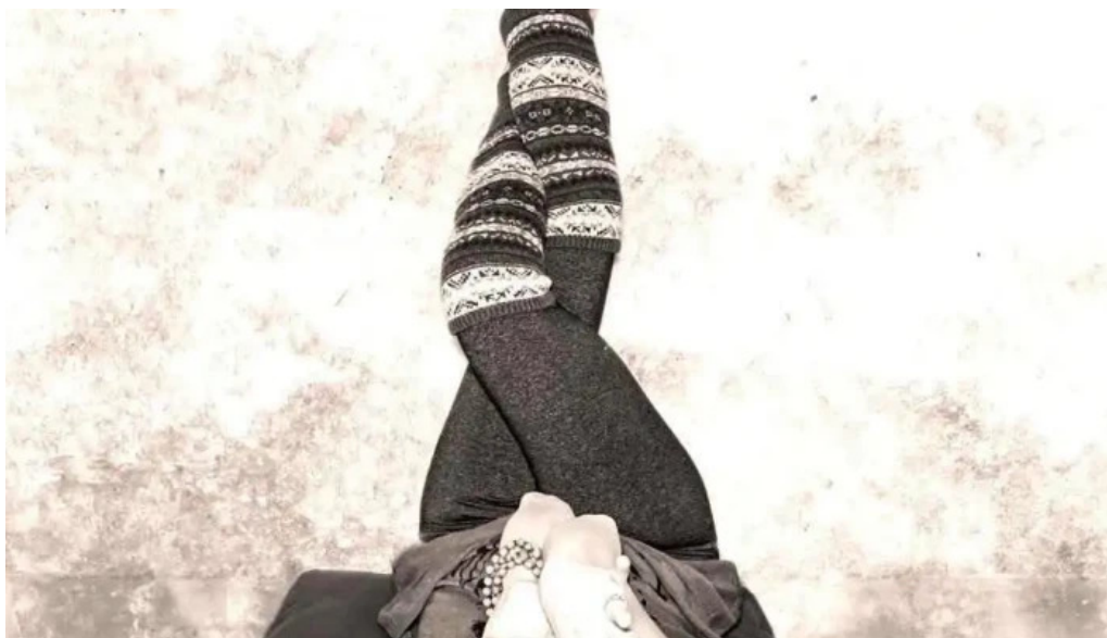
Balance yoga a community wellness center by owner