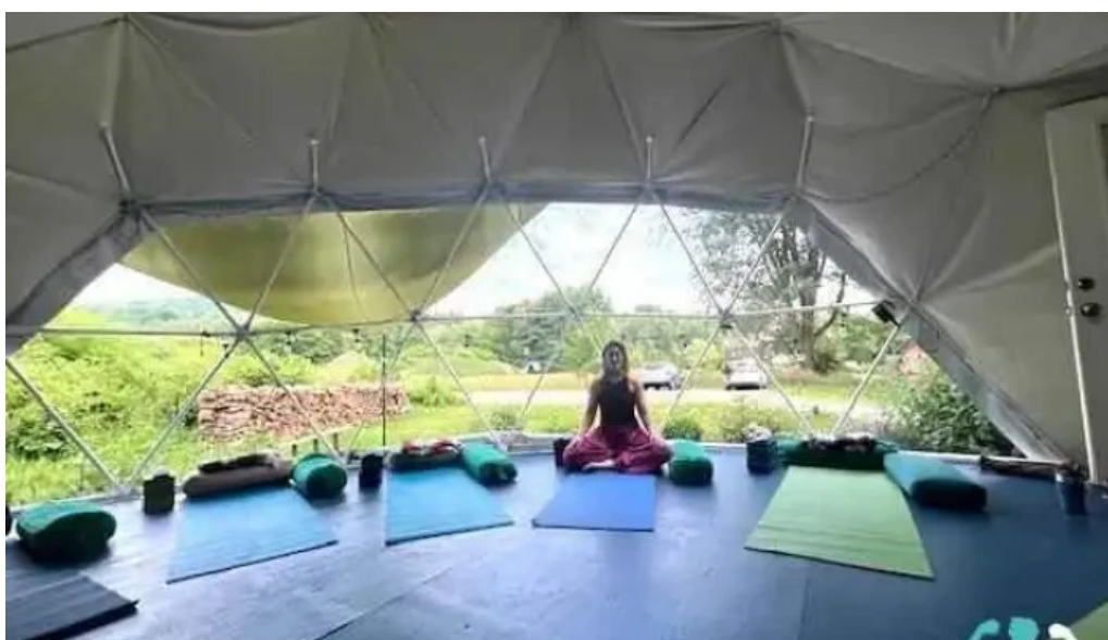
Balance yoga a community wellness center all